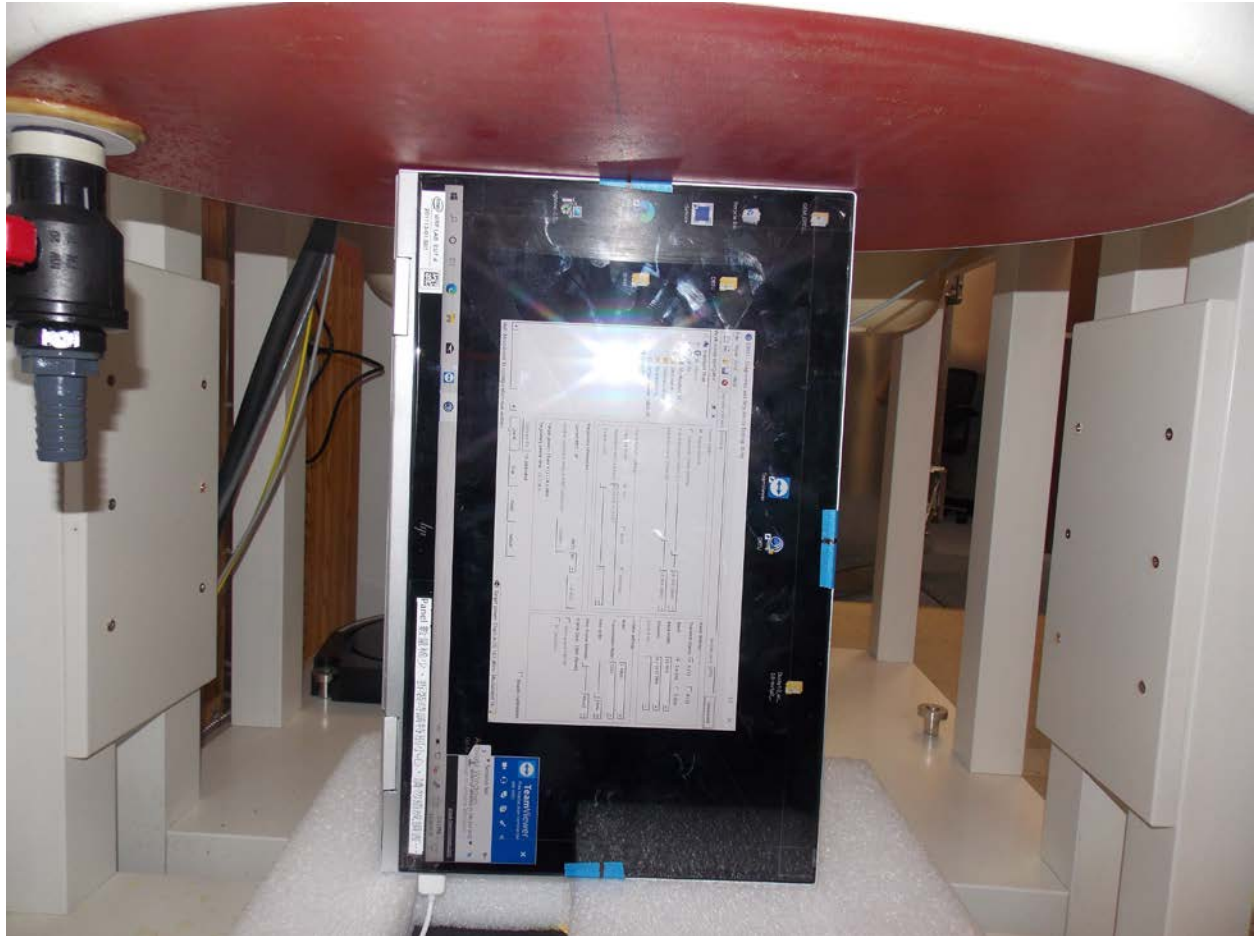
Test Position Left 0 mm Gap

Note: All cables removed prior to testing.