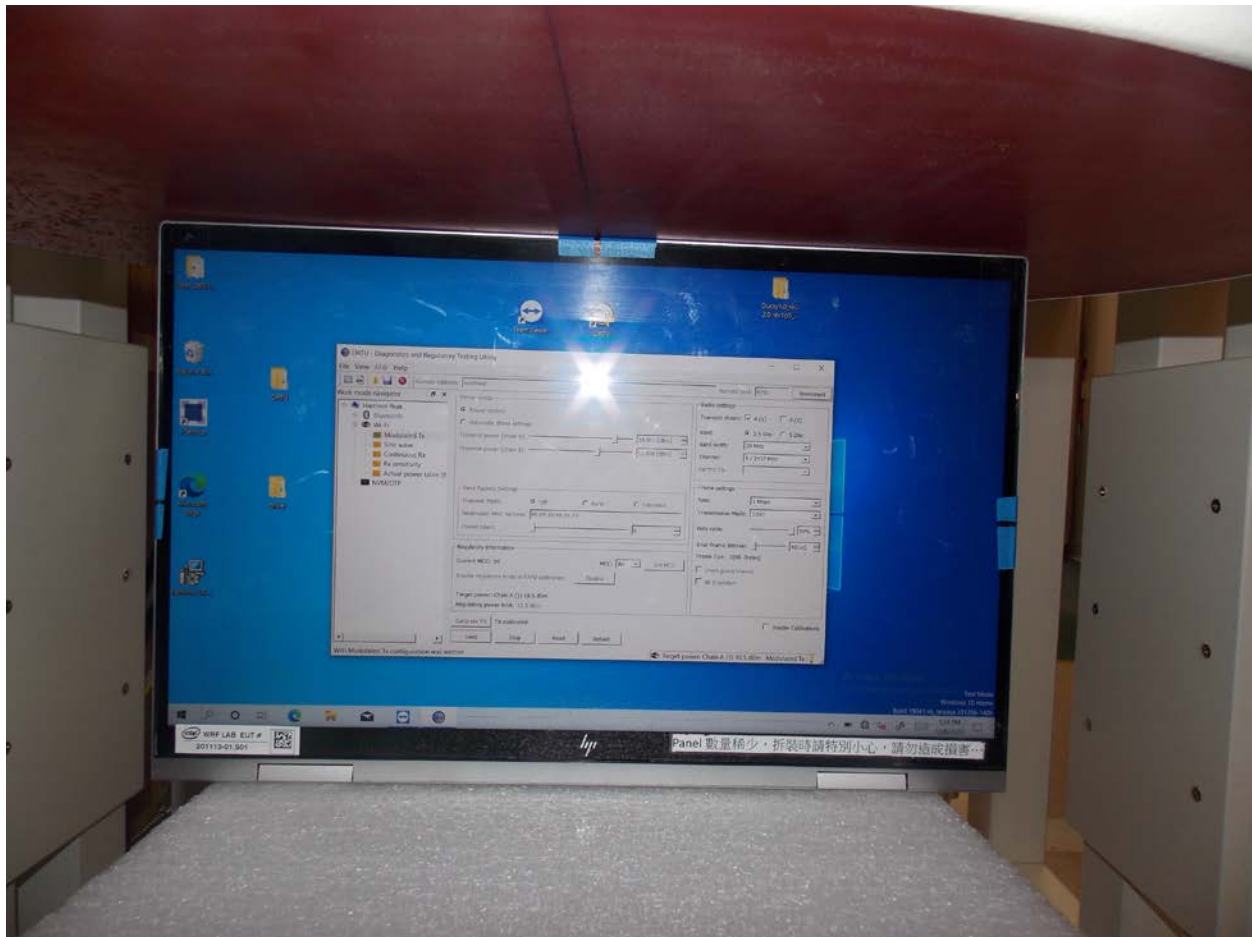
Test Position Laptop 0 mm Gap

Note: All cables removed prior to testing.