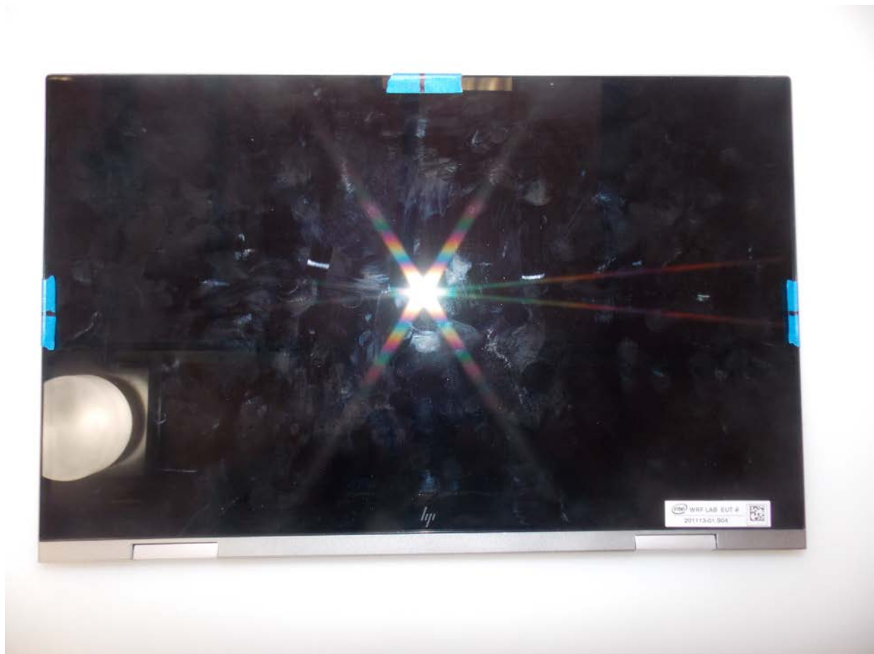
Front of Device Tablet Mode