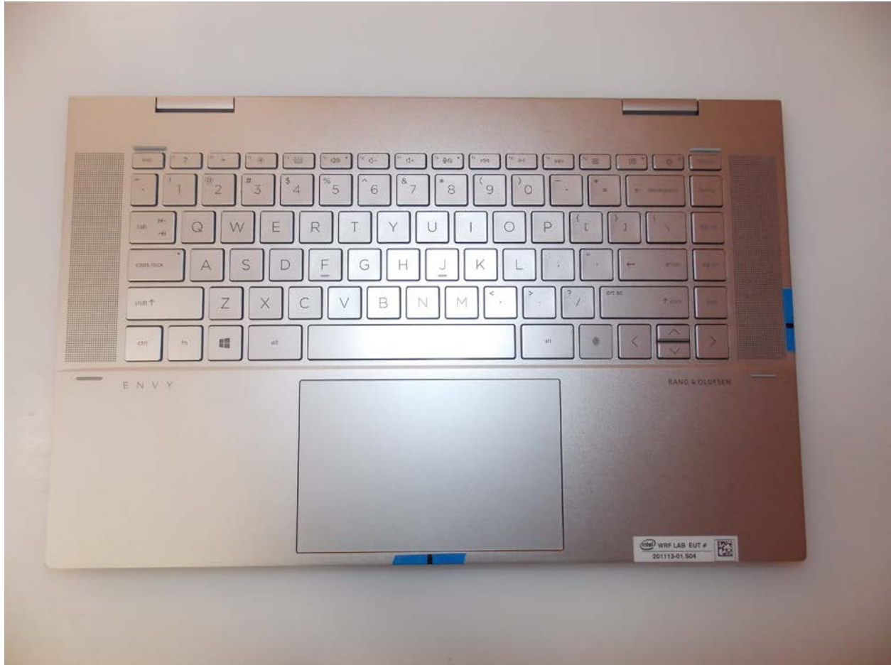
Back of Device Tablet Mode