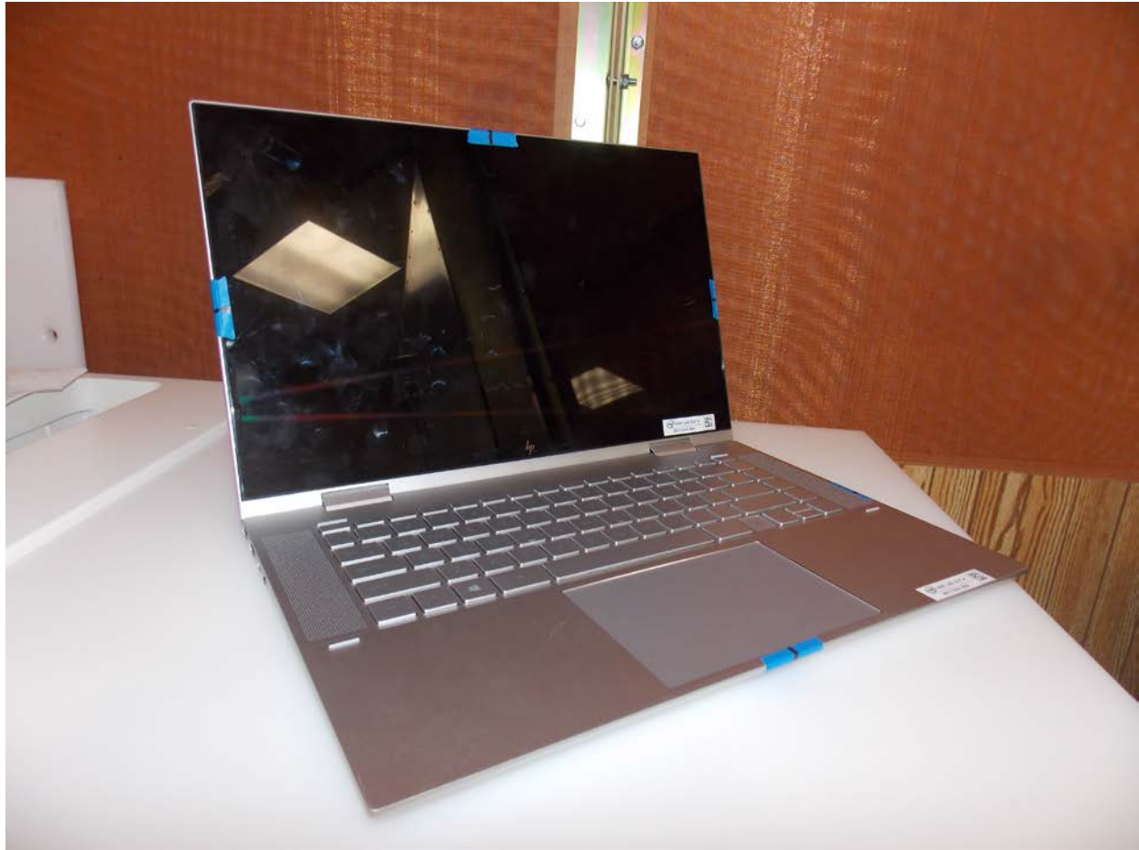
Front of Device Laptop Mode