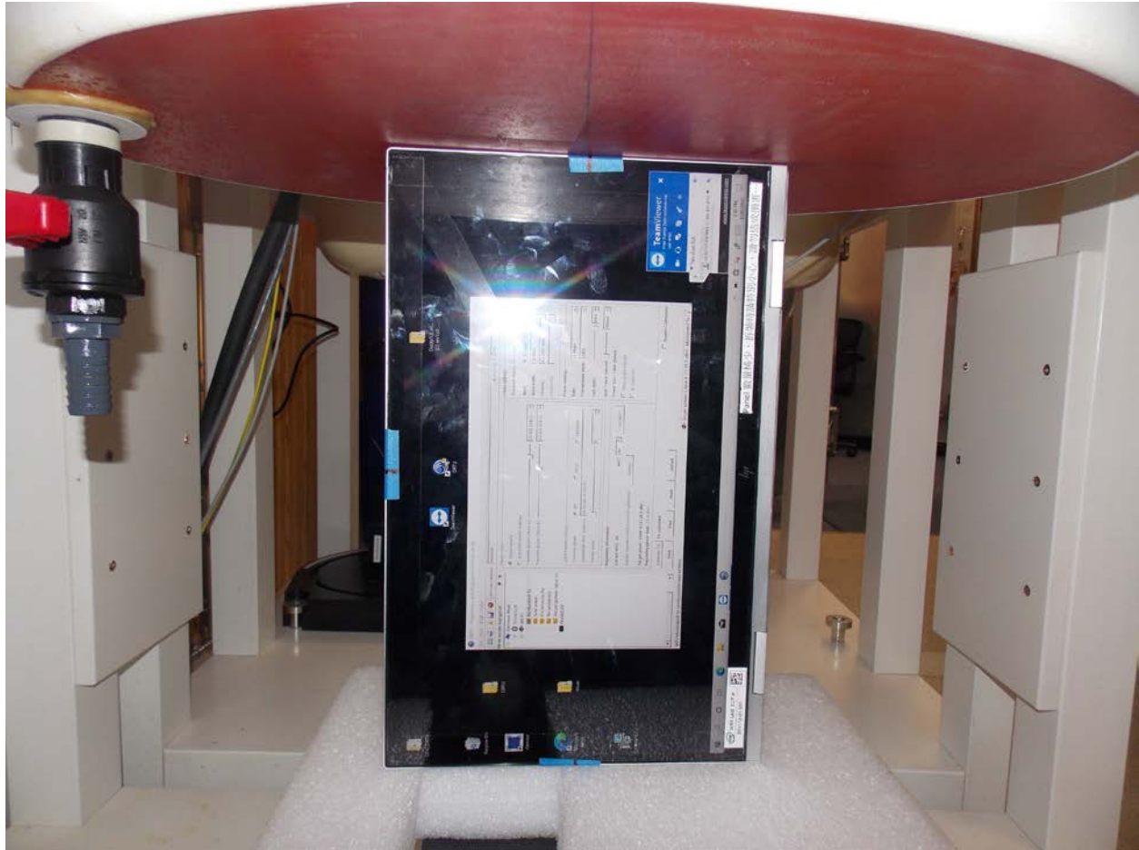
Test Position Right 0 mm Gap

Note: All cables removed prior to testing.