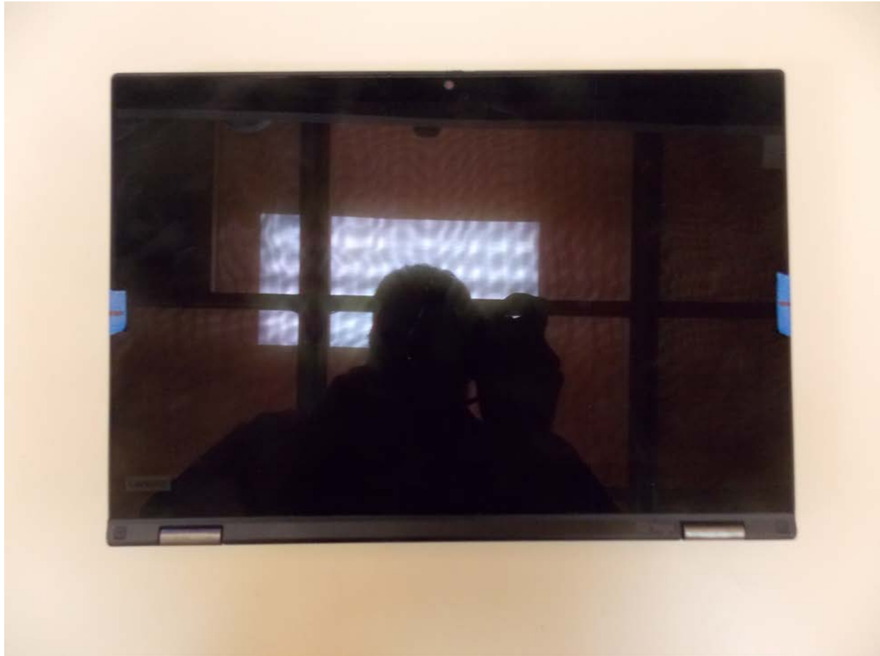
Front of Device Tablet Mode