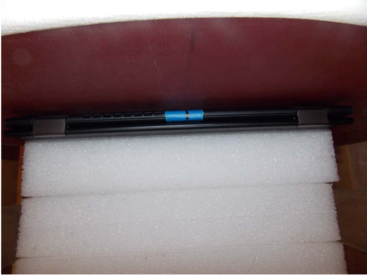
Test Position Back 0 mm Gap

Note: All cables removed prior to testing.