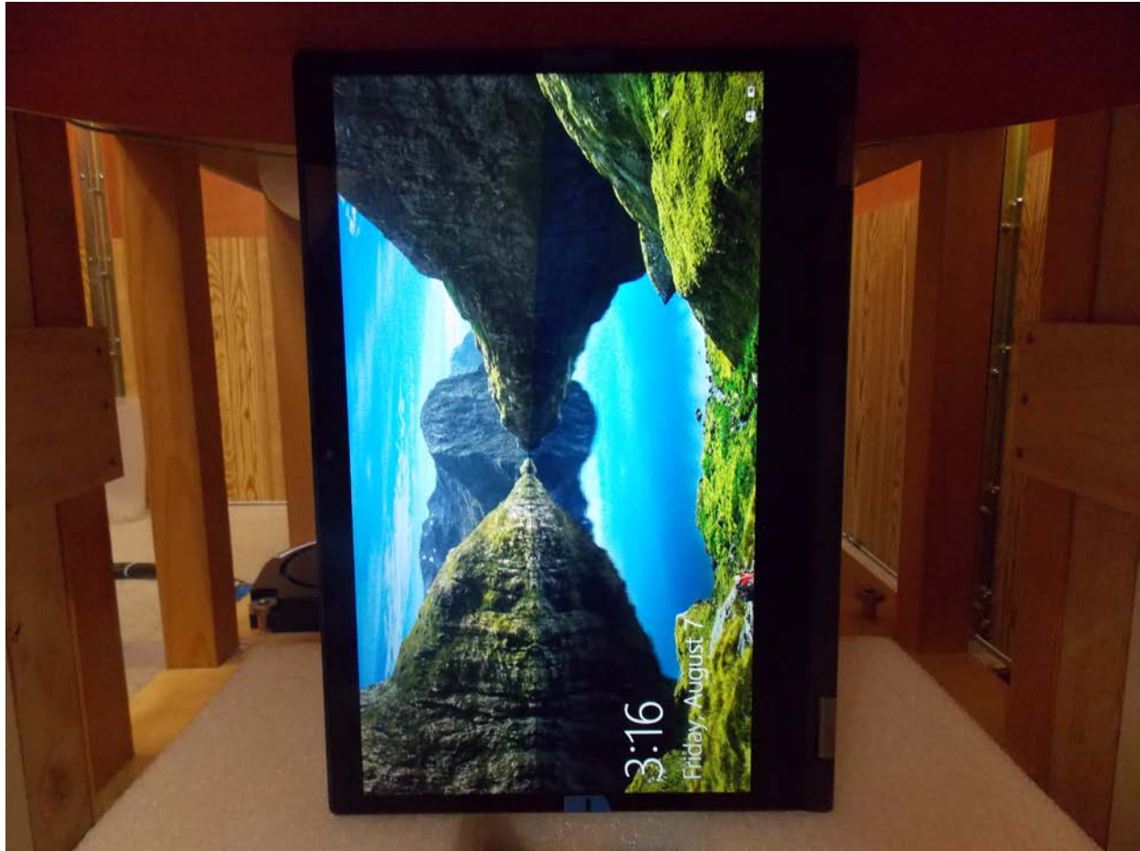
Test Position Right 0 mm Gap

Note: All cables removed prior to testing.