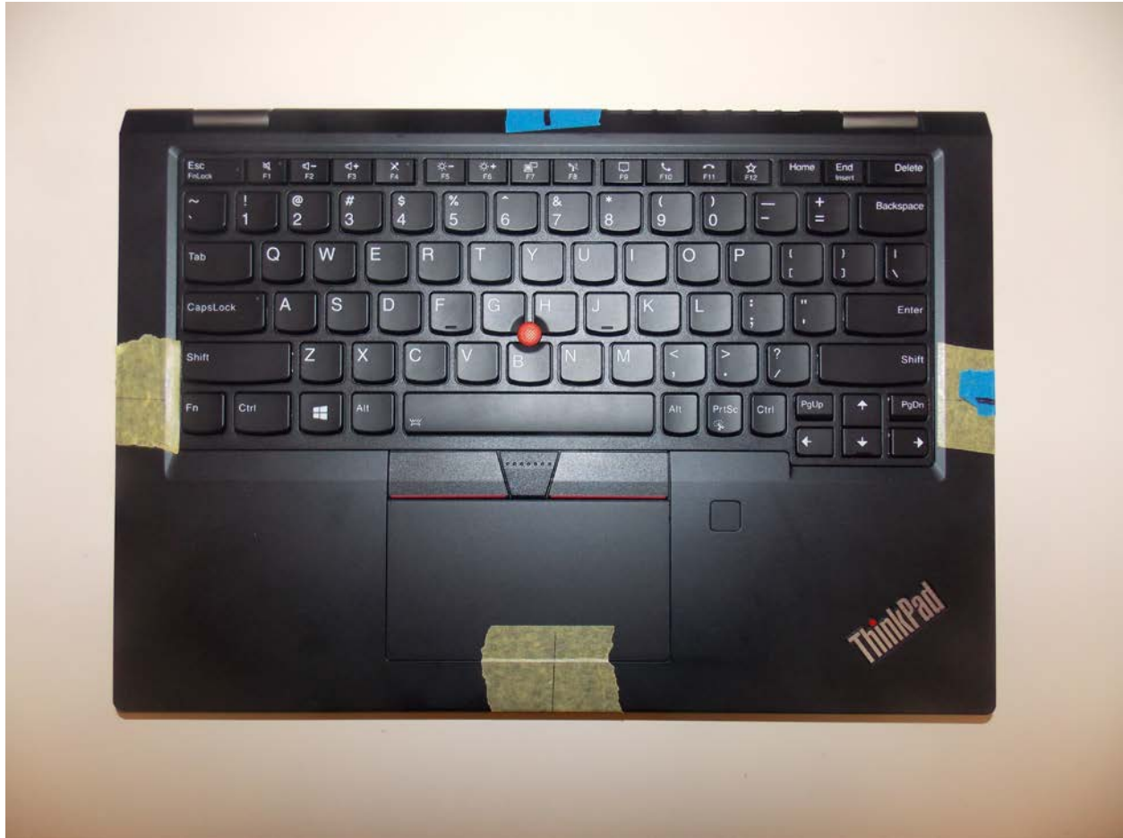
Back of Device Tablet Mode