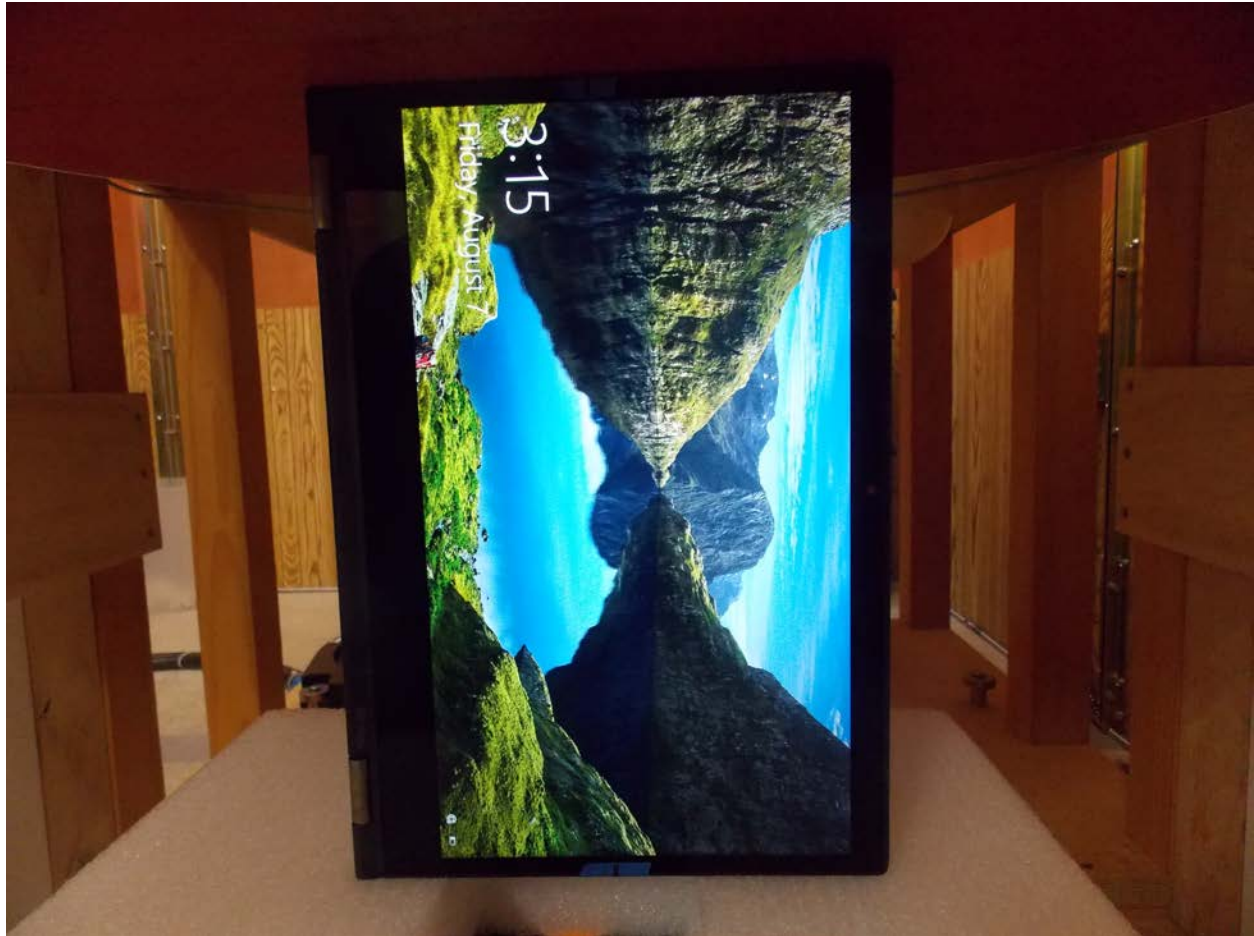
Test Position Left 0 mm Gap

Note: All cables removed prior to testing.