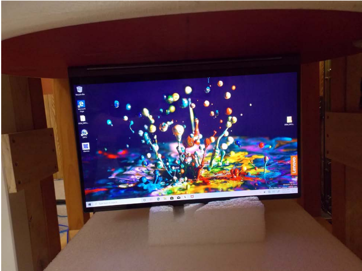
Test Position Bottom 0 mm Gap

Note: All cables removed prior to testing.