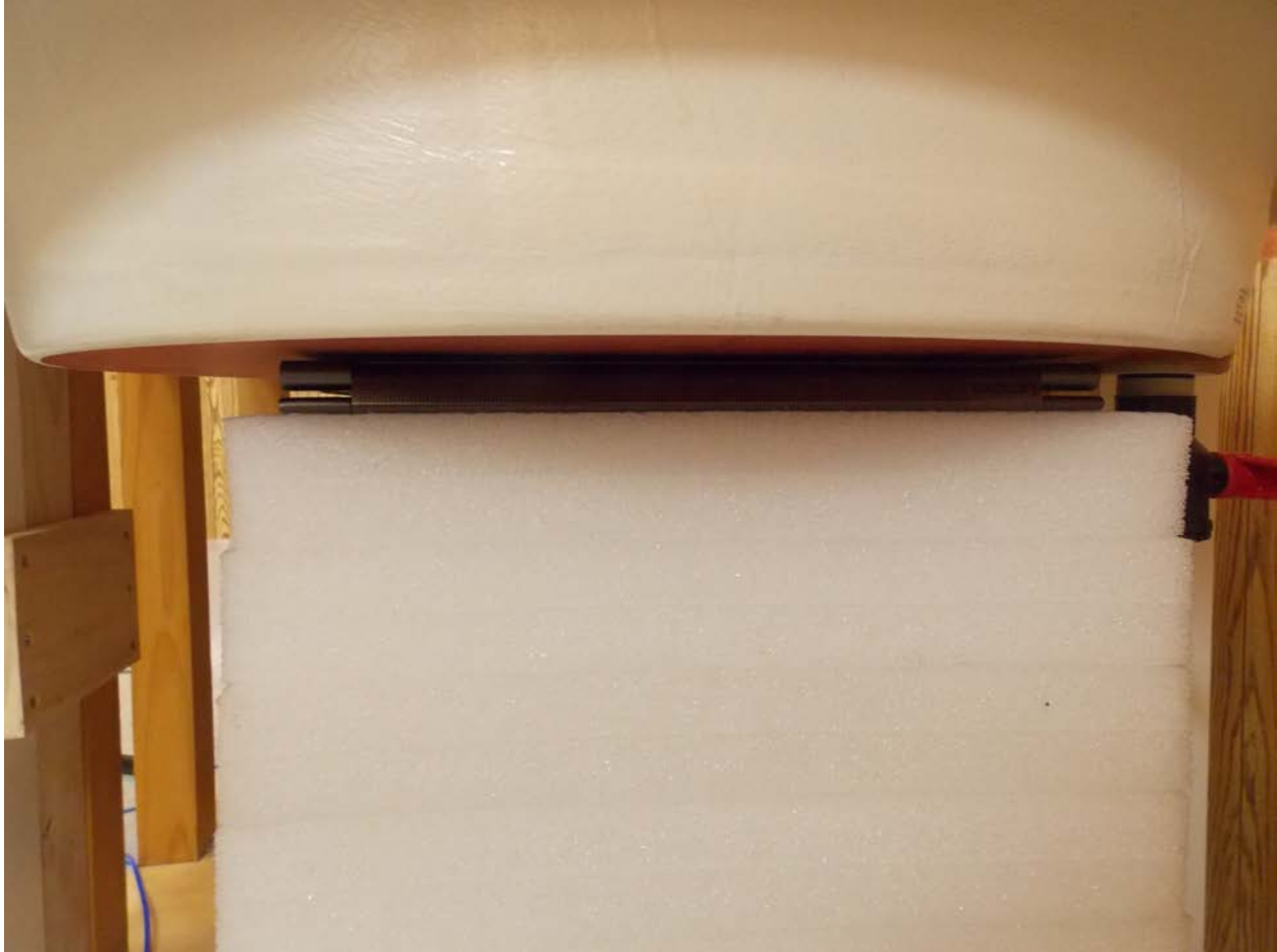
Test Position Back 0 mm Gap

Note: All cables removed prior to testing.