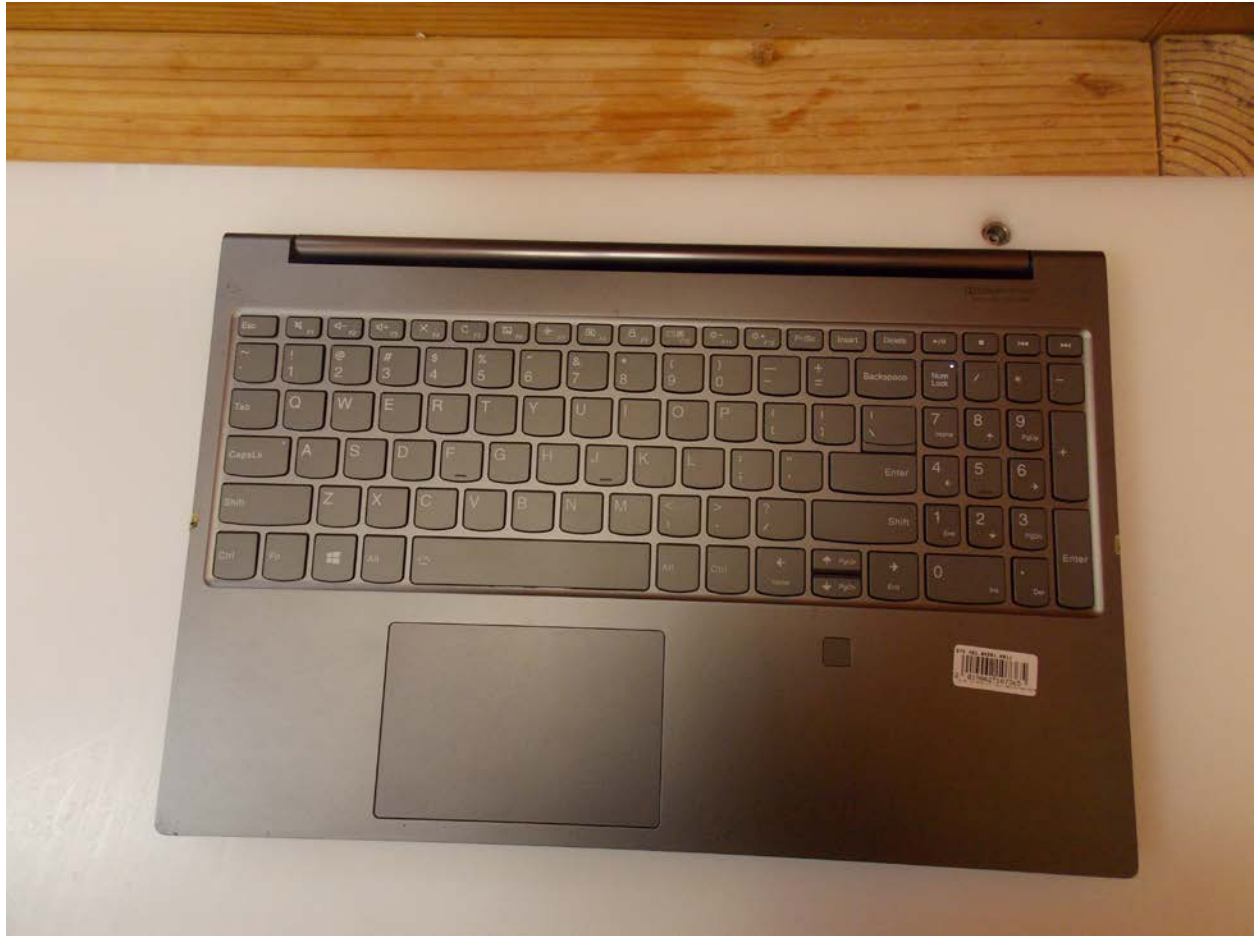
Back of Device Tablet Mode