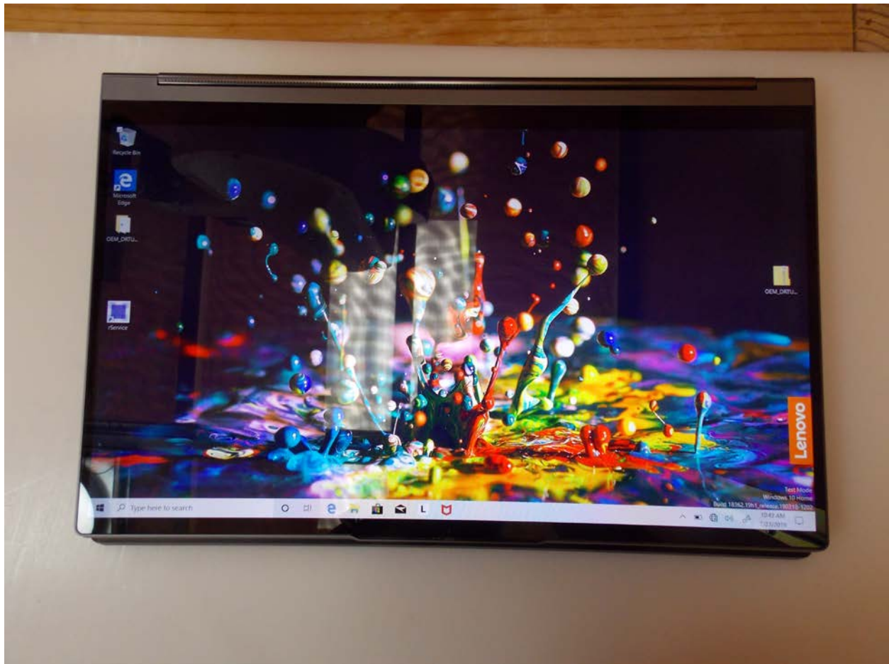
Front of Device Tablet Mode