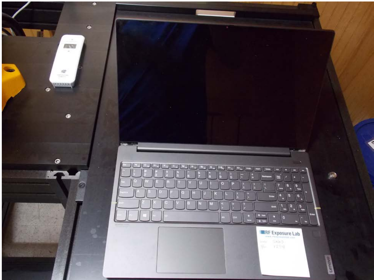
Front of Device Laptop Mode