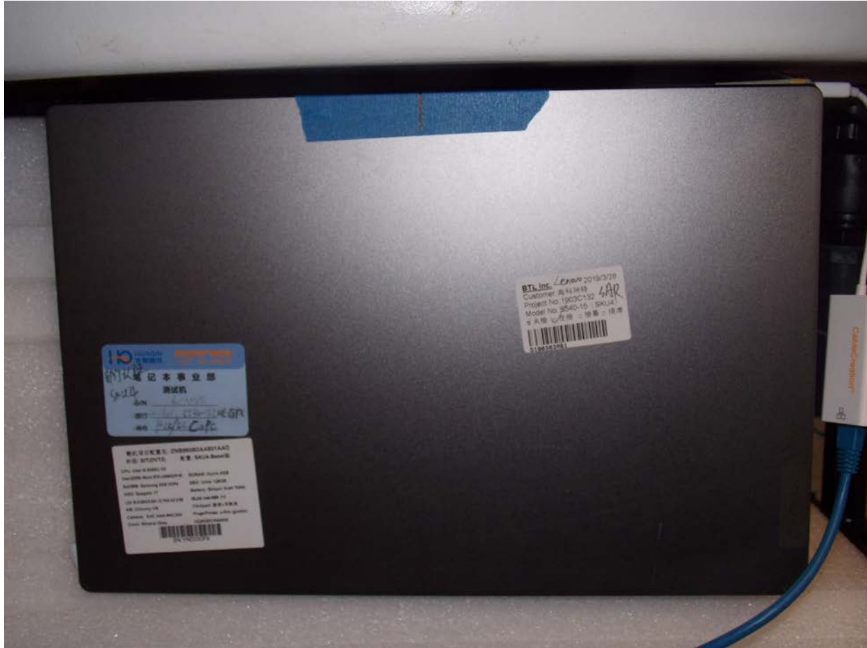
Test Position Back 0 mm Gap

Note: All cables are removed prior to testing.