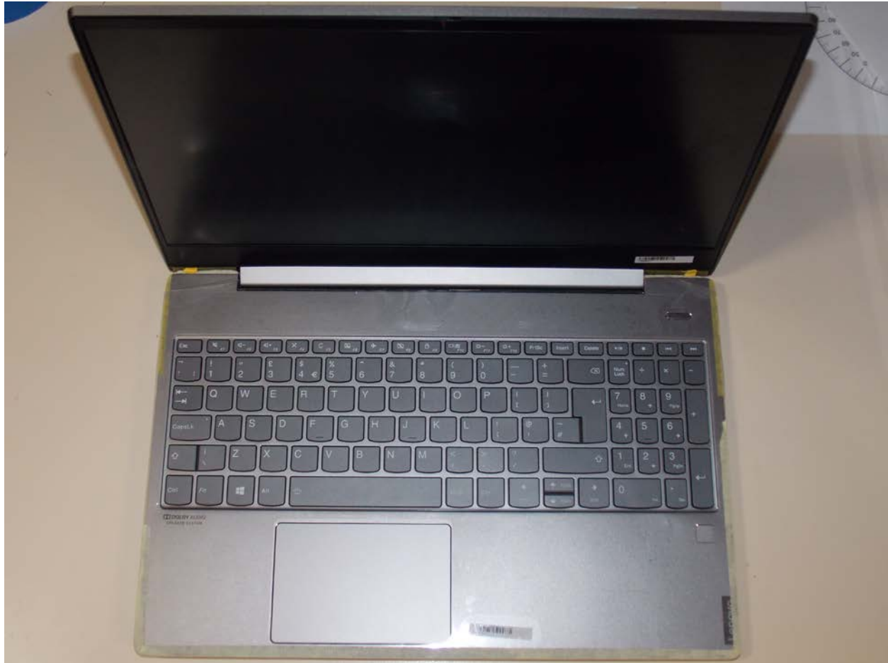
Front of Device Laptop Mode