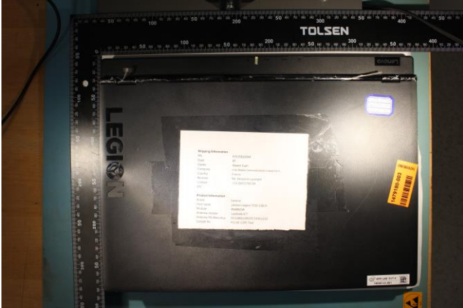
Tablet Mode Front