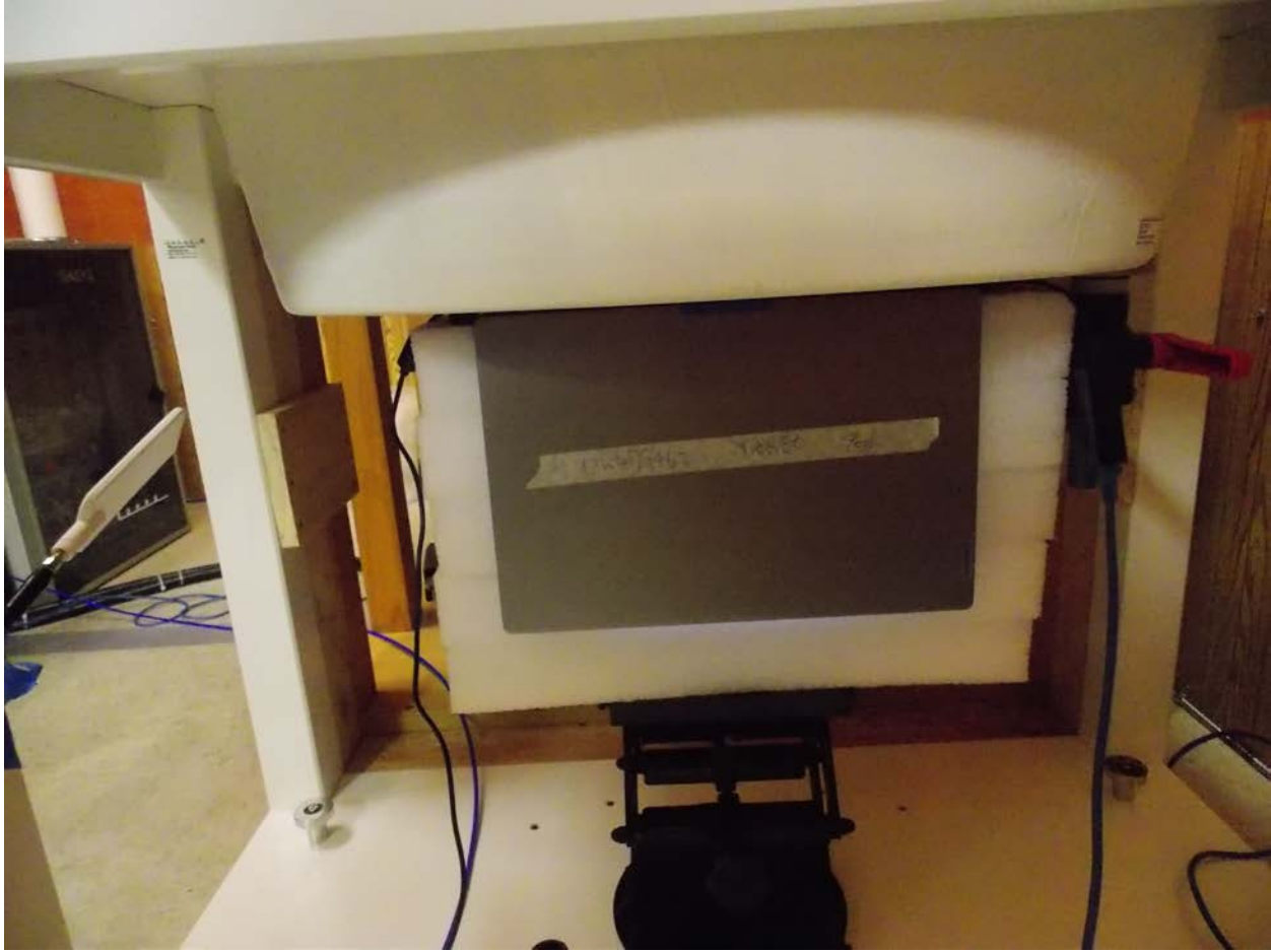
Test Position Back 0 mm Gap

Note: All cables are removed prior to testing.