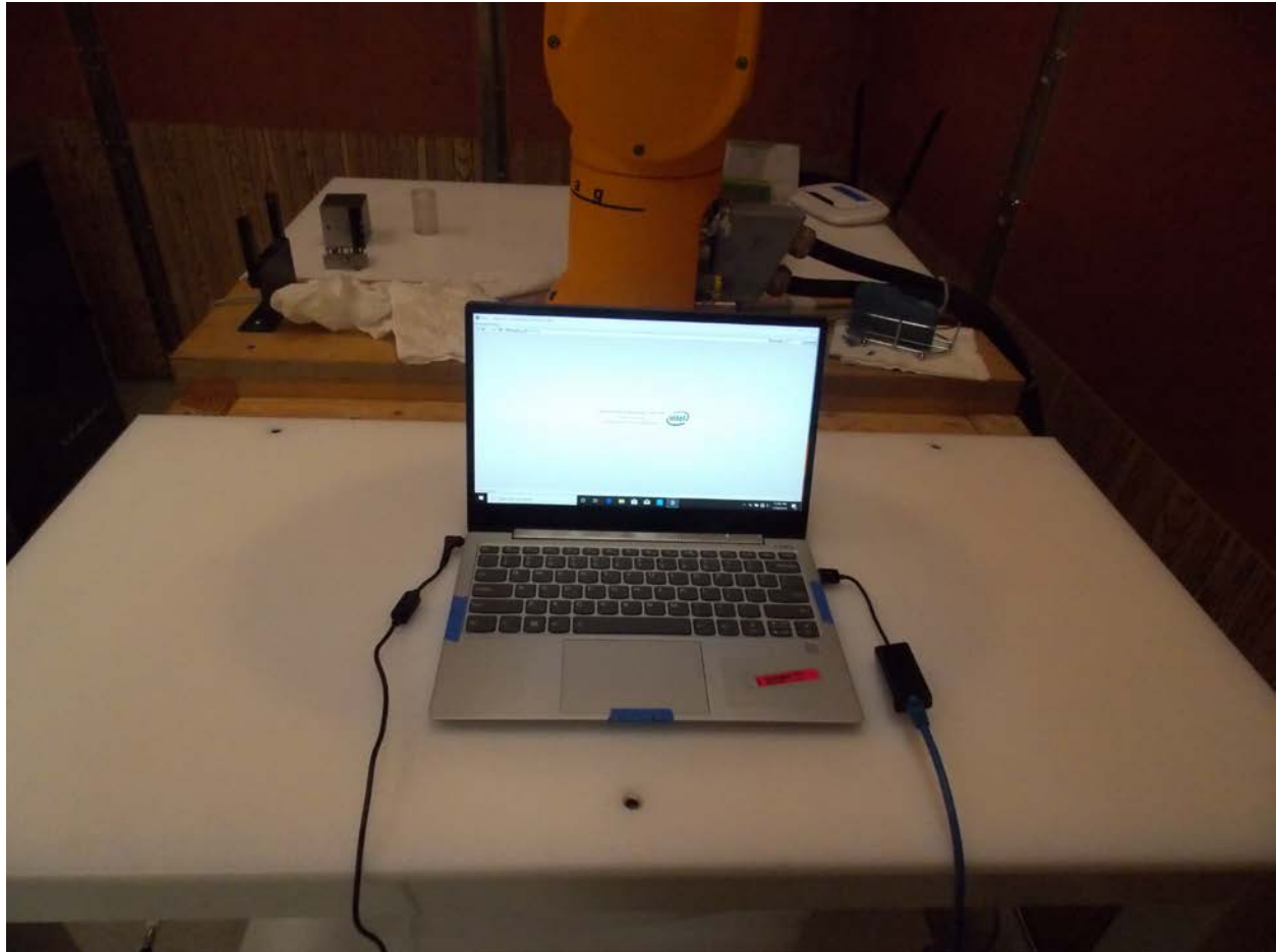
Front of Device Laptop Mode