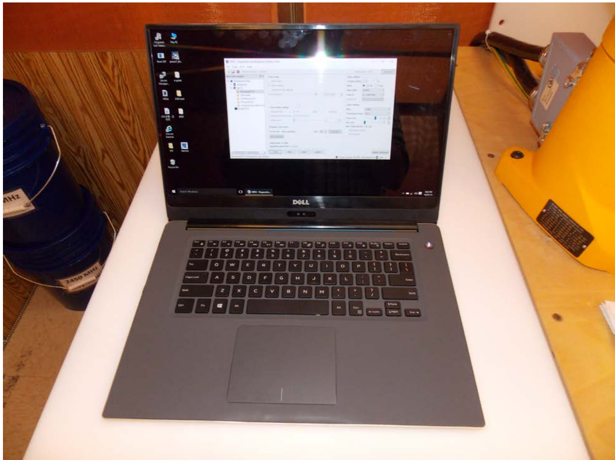
Front of Device