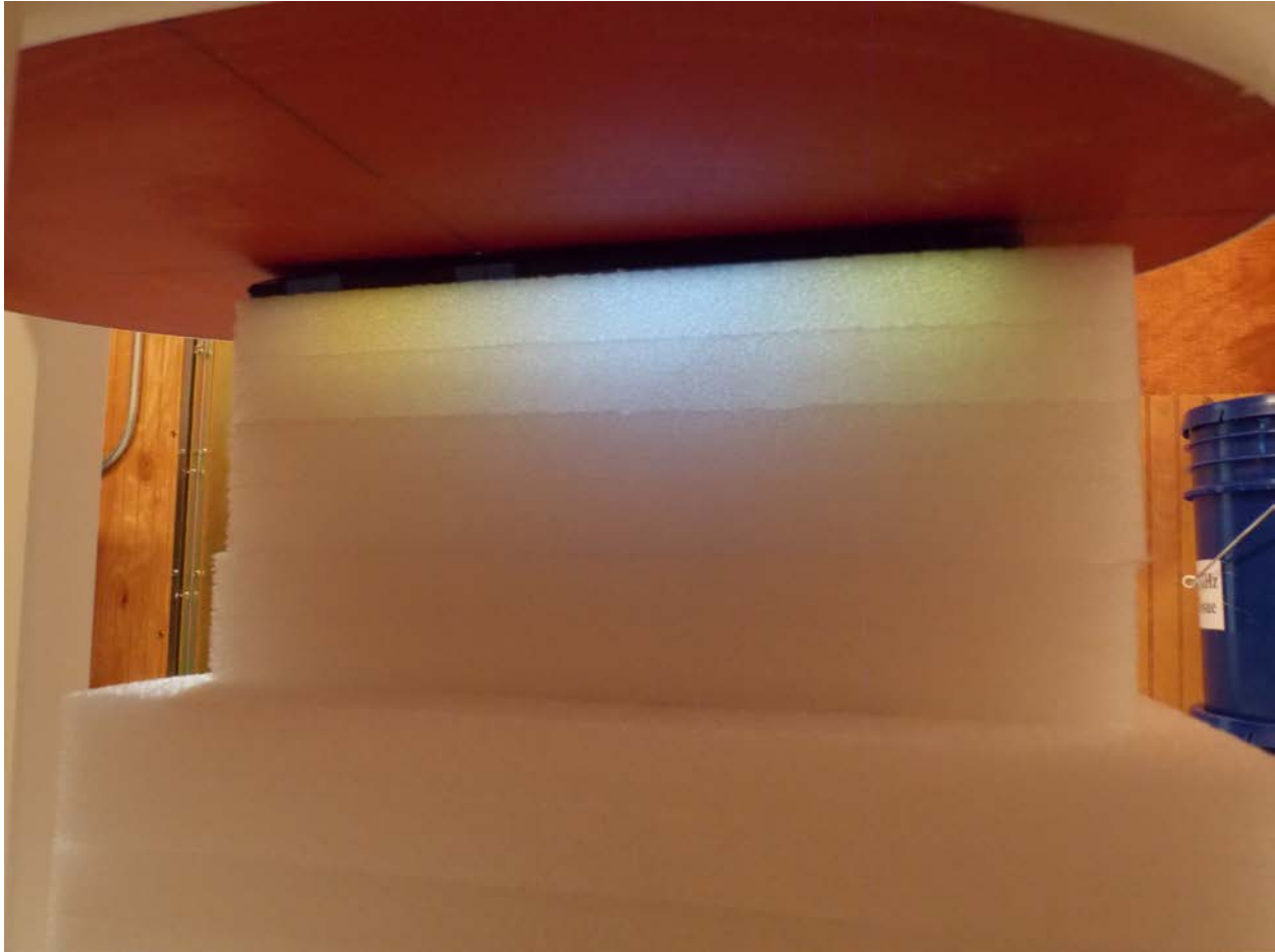
Test Position Back 0 mm Gap