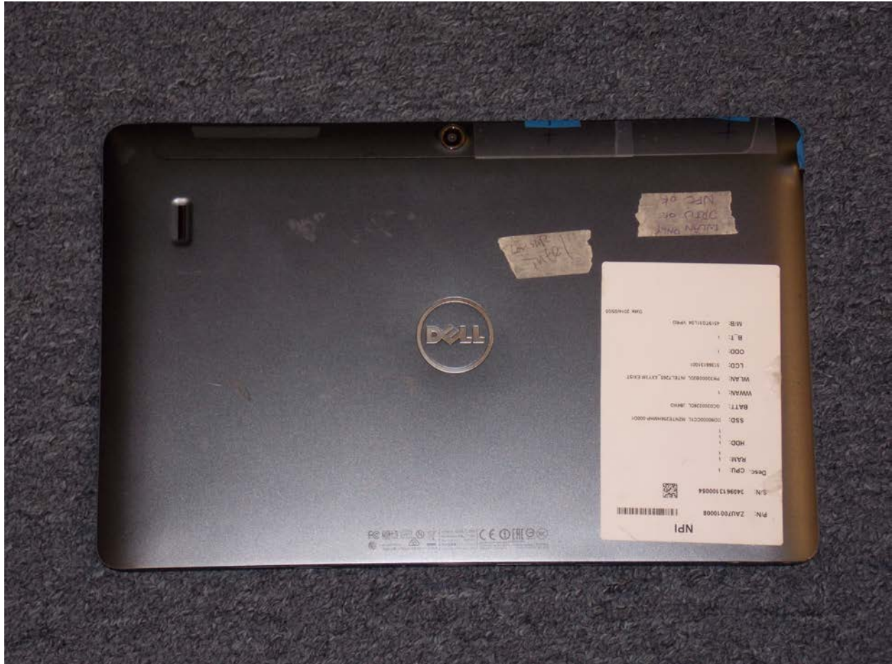
Back of Device Tablet Mode