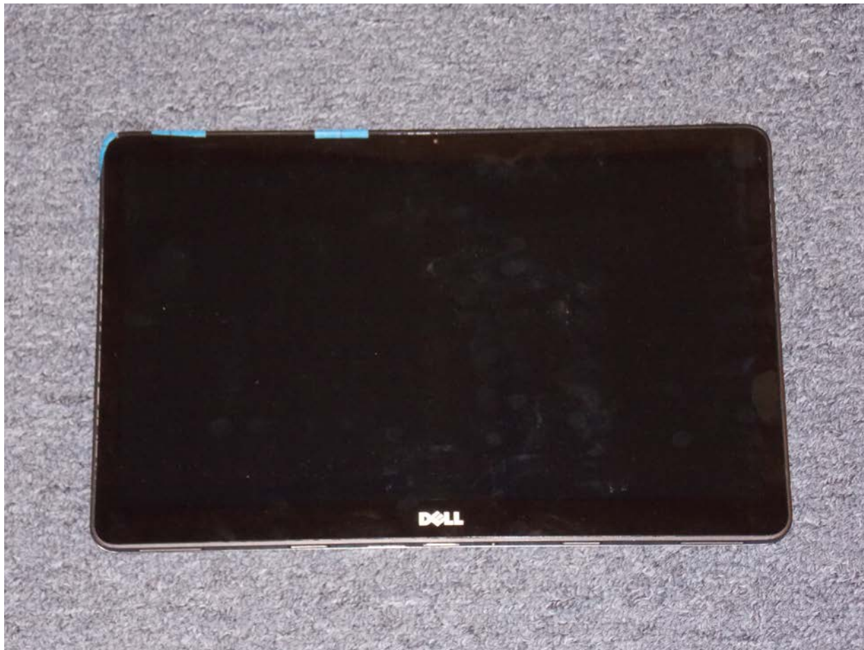
Front of Device Tablet Mode