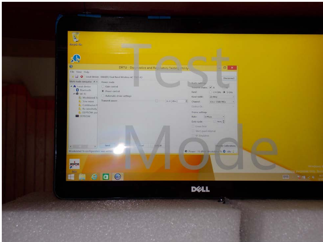
Test Position Top 0 mm Gap