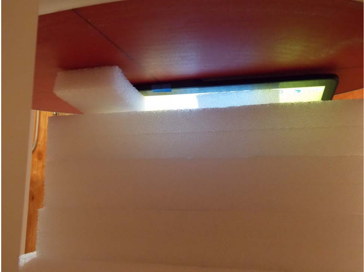
Test Position Curved Edge 0 mm Gap