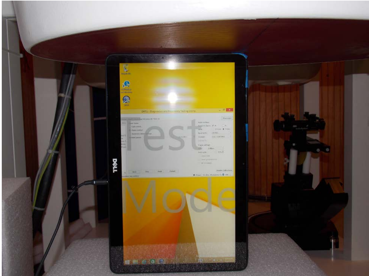
Test Position Left Side 0 mm Gap