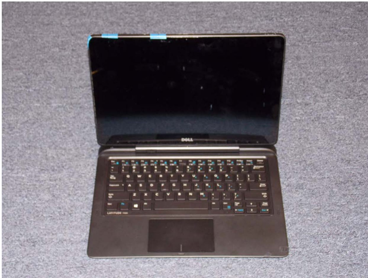
Front of Device Laptop Mode