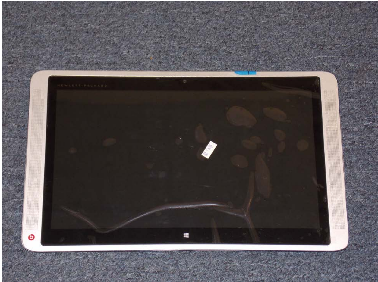
Front of Device