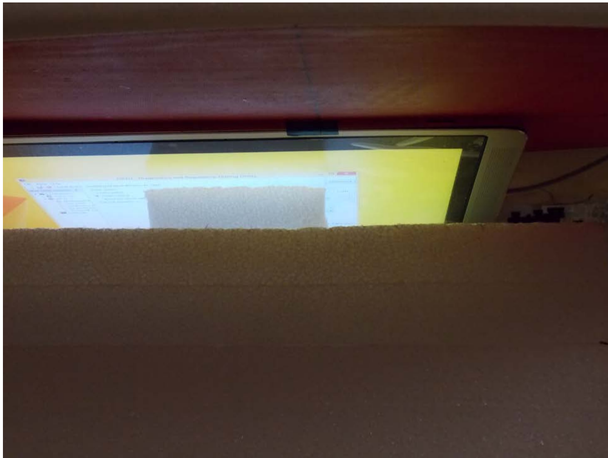
Test Position Curved Edge 0 mm Gap