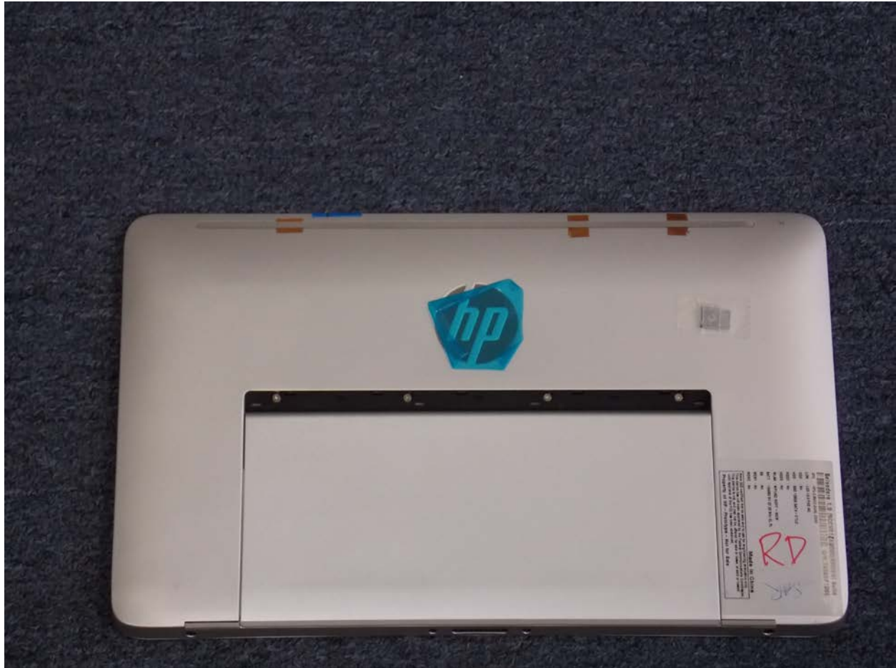
Back of Device