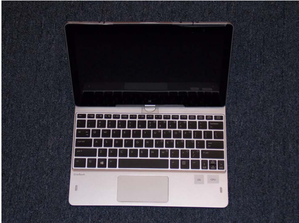
Front of Device Notebook Mode