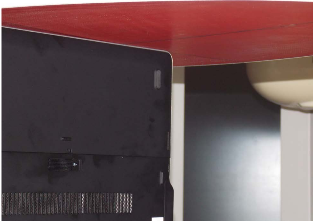
Test Position Long Edge Main Antenna 0 mm Gap