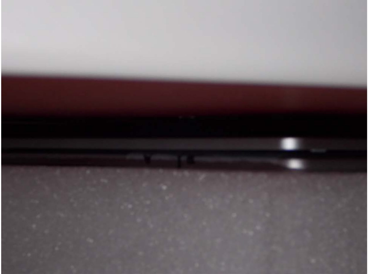
Test Position Bottom Aux Antenna 0 mm Gap