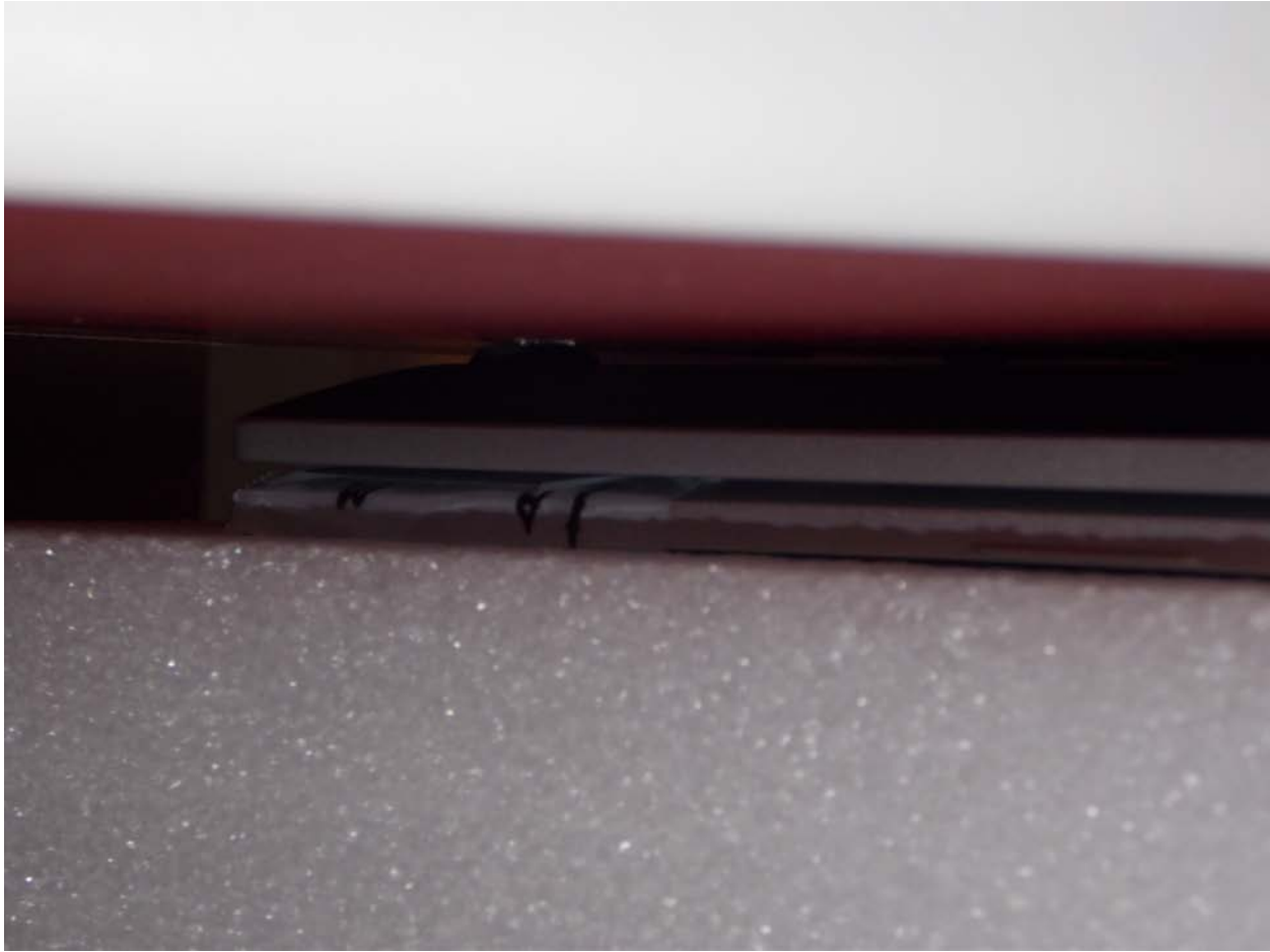
Test Position Bottom Main Antenna 0 mm Gap