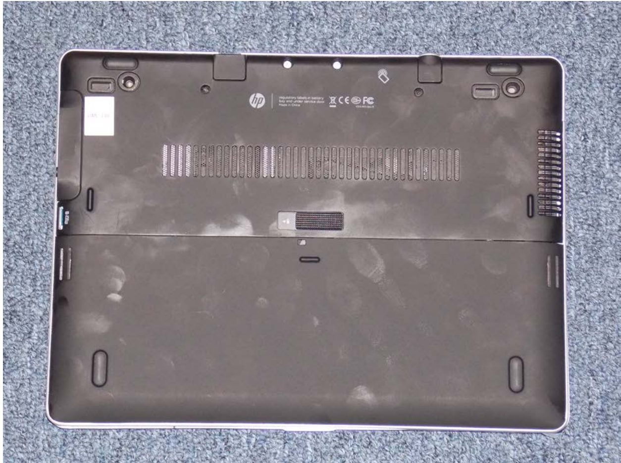
Back of Device