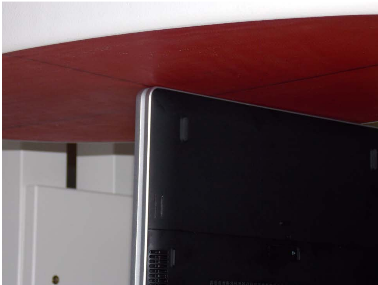
Test Position Long Edge Aux Antenna 0 mm Gap