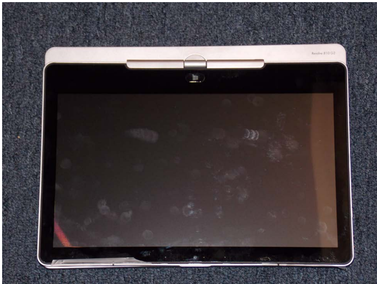
Front of Device Tablet Mode