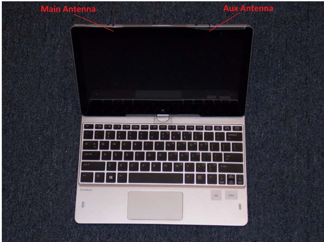
Antenna Locations Notebook Mode