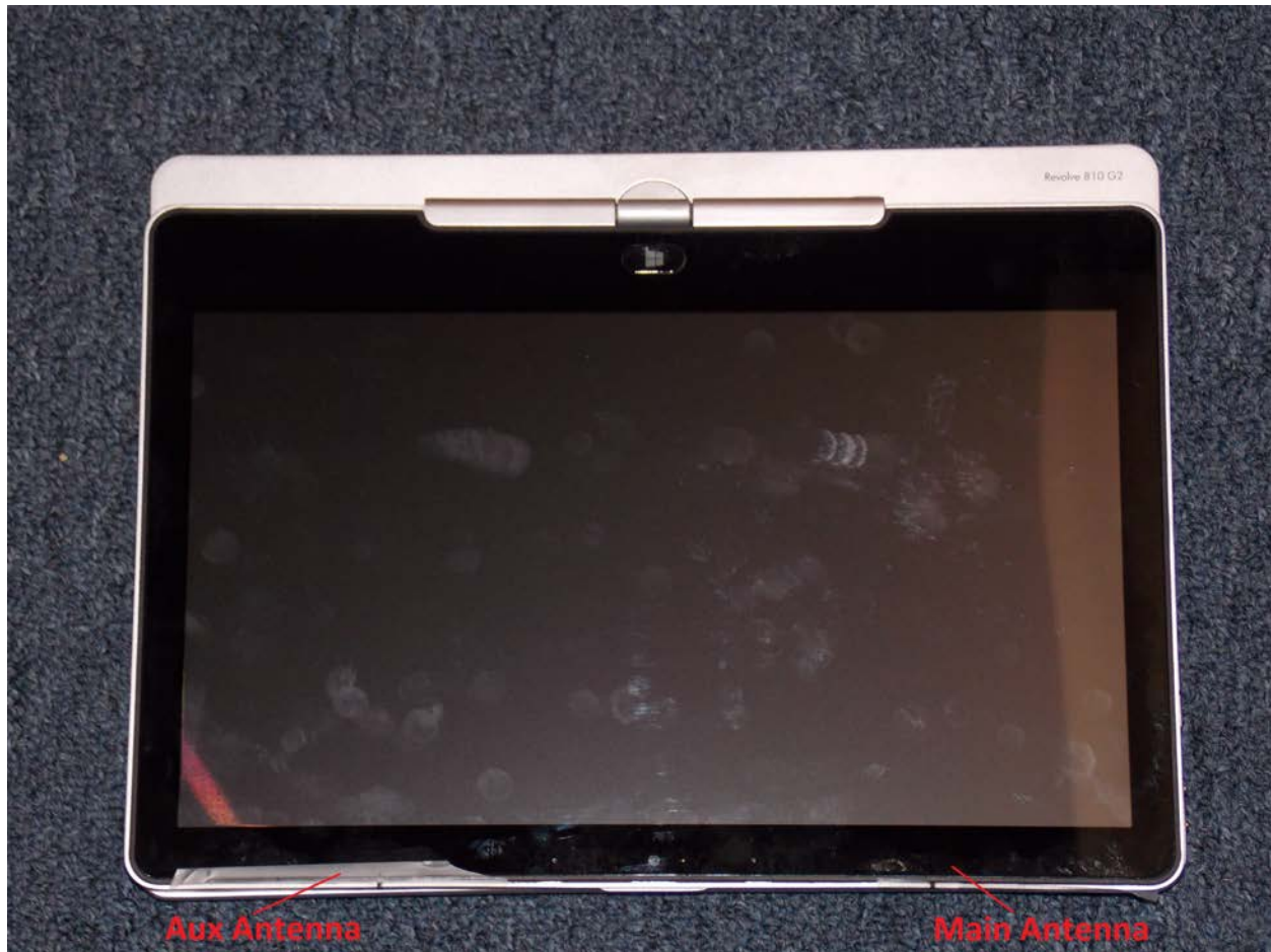
Antenna Locations Tablet Mode