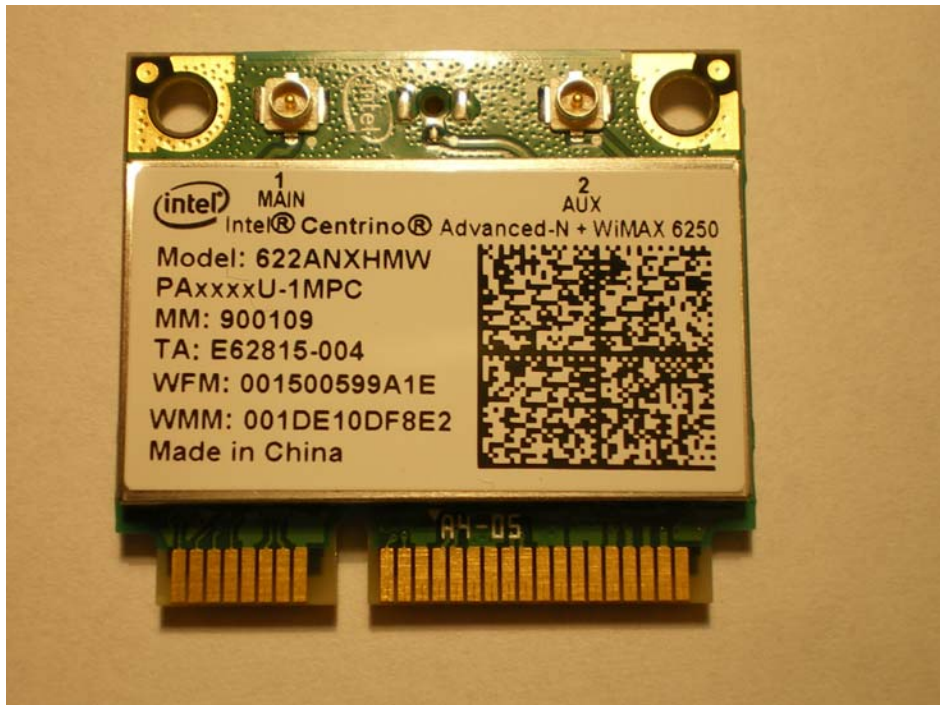
Photo showing label placement on half-mini card.

Label wraps around onto the other side of the board.