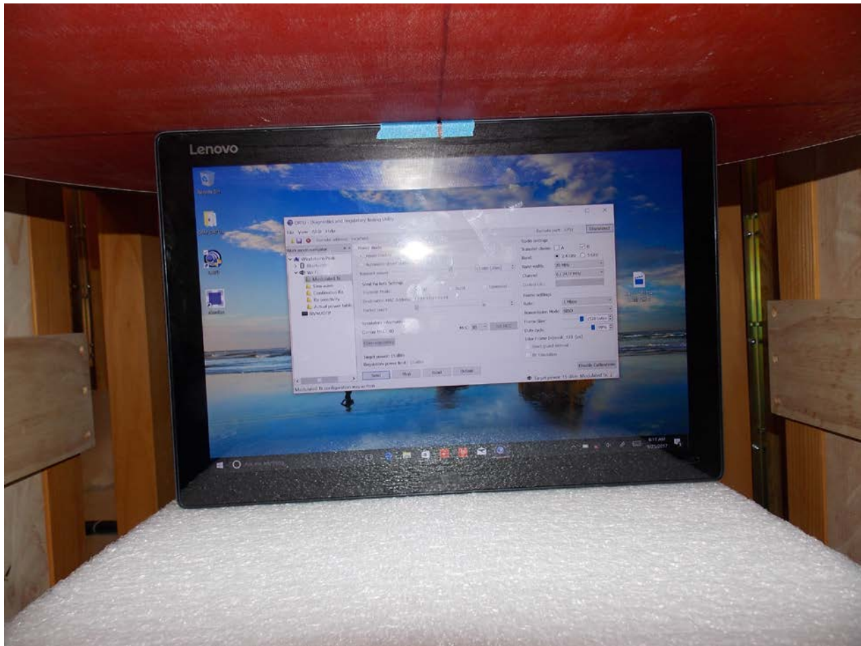
Test Position Top 0 mm Gap