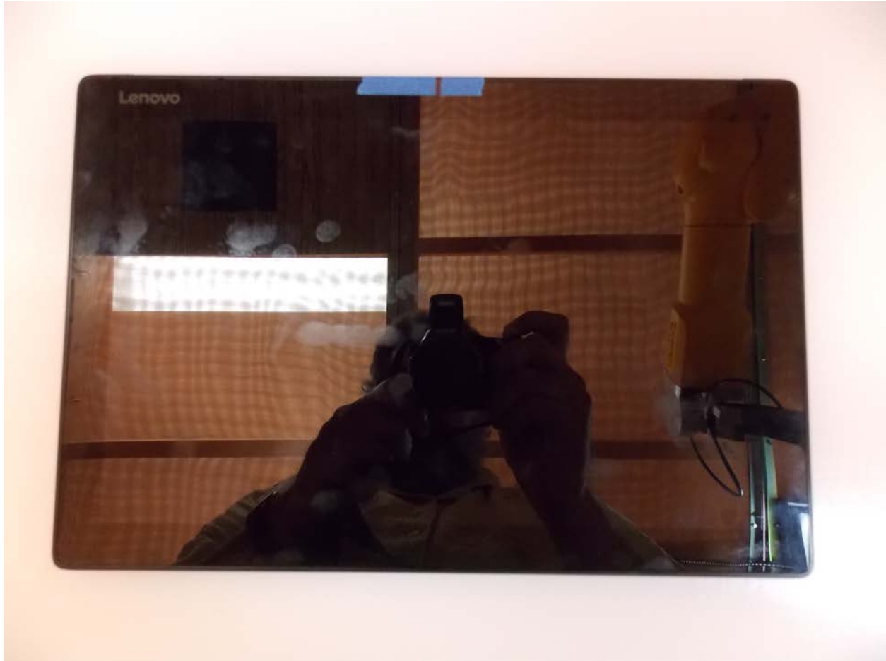
Front of Device Tablet Mode