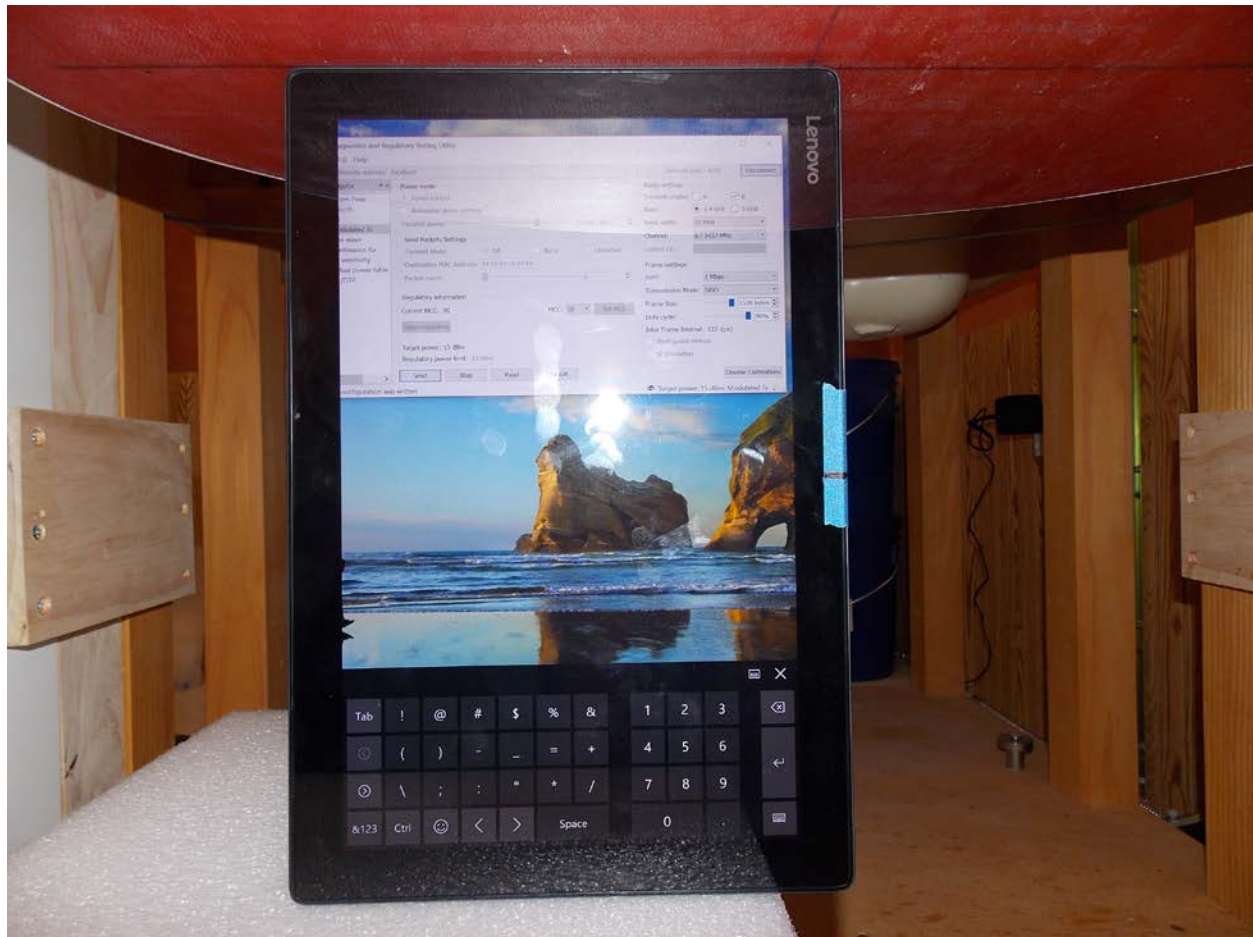
Test Position Left 0 mm Gap