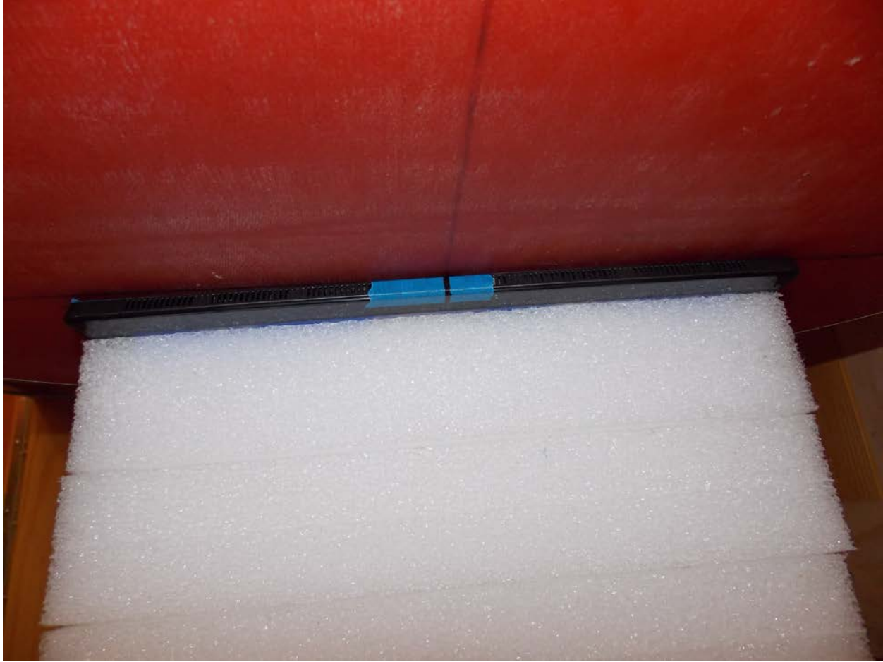
Test Position Back 0 mm Gap