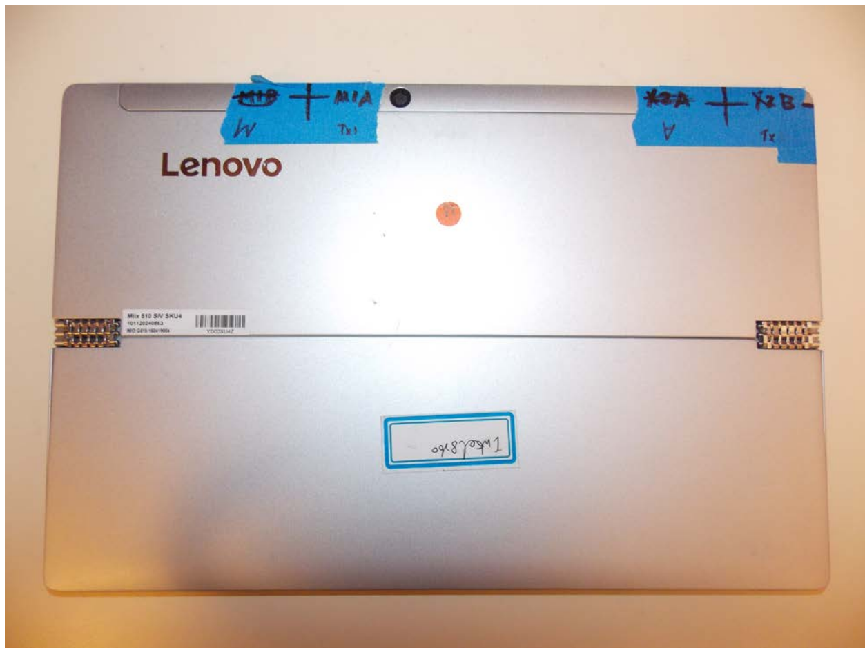
Back of Device Tablet Mode