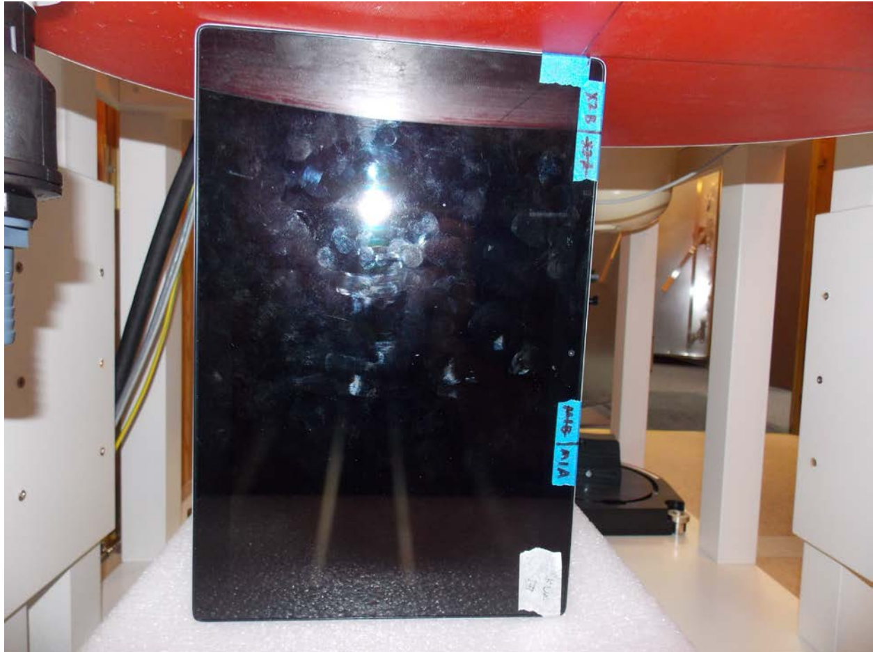
Test Position Left 0 mm Gap