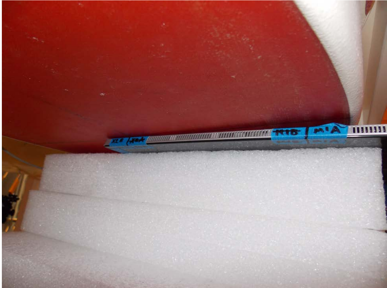
Test Position Back 0 mm Gap