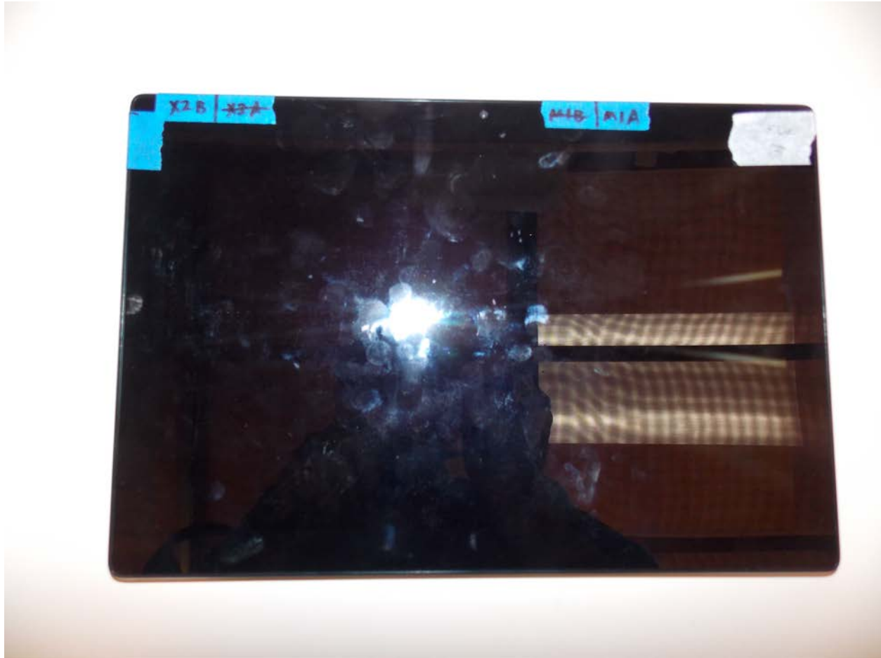
Front of Device Tablet Mode