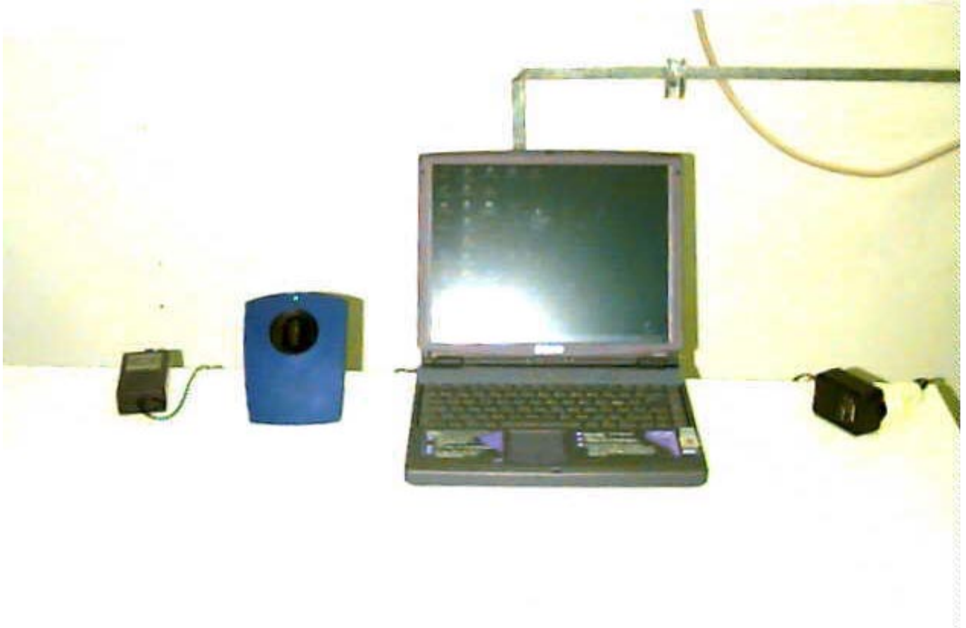
Photograph 1.1: EUT and Peripherals on Non-Conductive Table; Front Side View