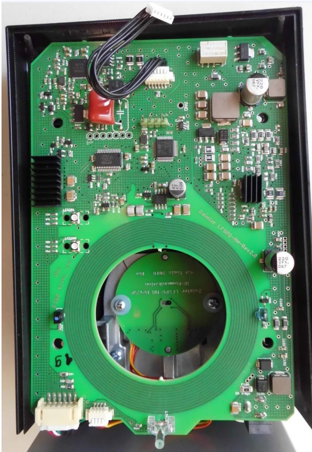
Fig.4: Main PCB of Daimler LFSPG-MH