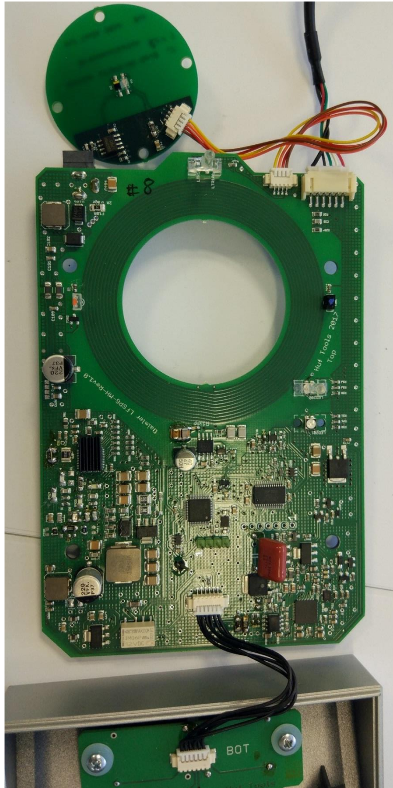
Fig. 1 : PCBs of Daimler LFSPG.MH (TOP)