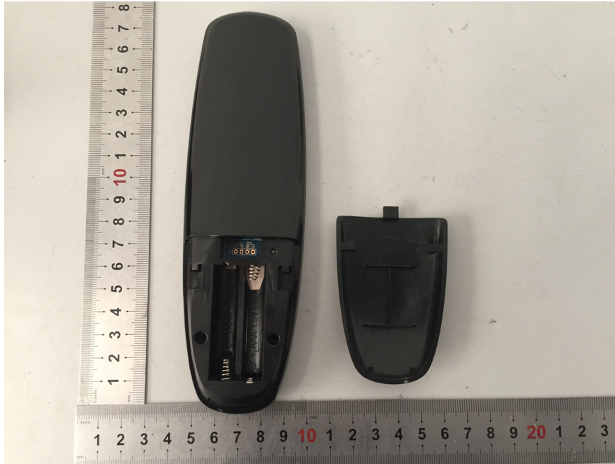
EUT – Cover off View-2