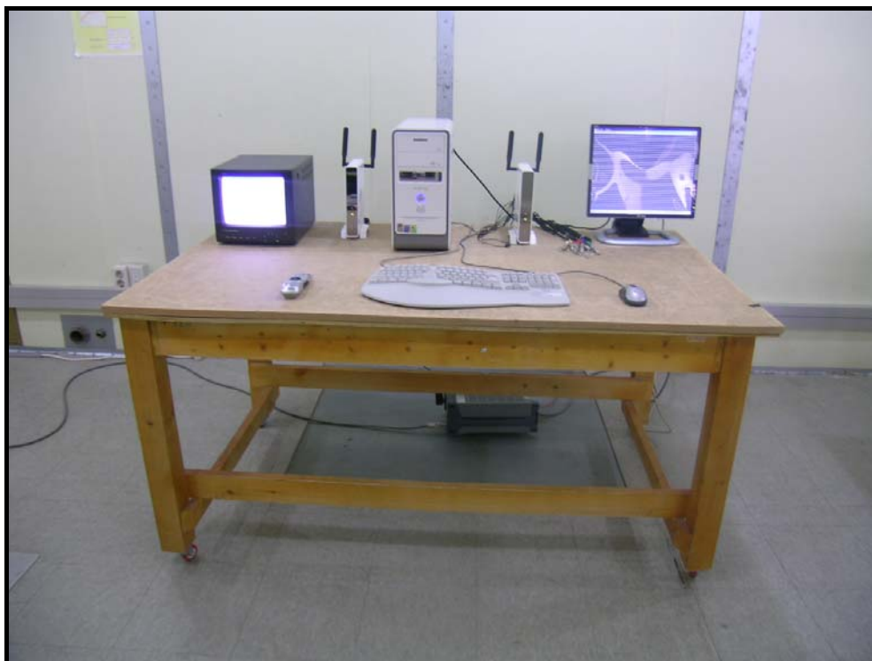
Photograph 1: Setup for Conducted Emissions