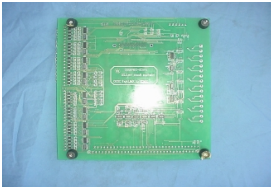
General Appearance of Load's PCB, (Front View)