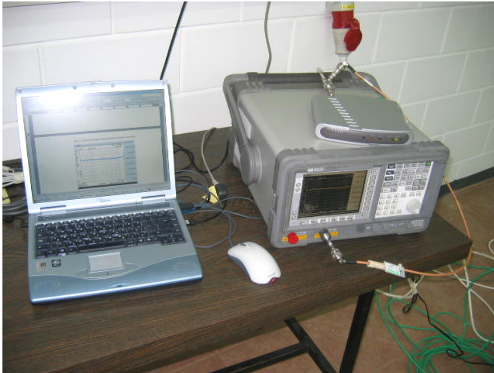
Photograph No.1 Peak output power and spurious emissions at RF antenna connector test setups