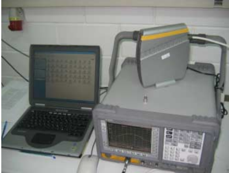
Photograph No.1 Peak output power and spurious emissions at RF antenna connector test setups