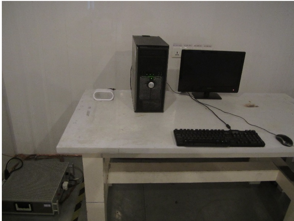
Setup for Conducted Emission