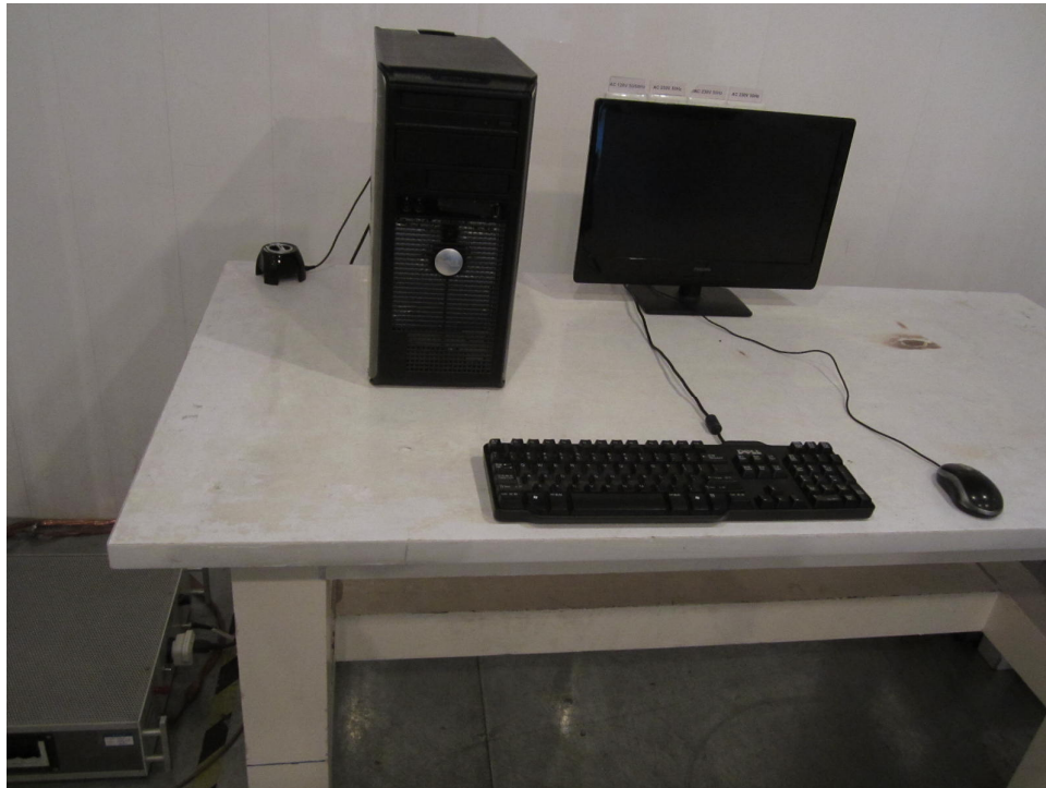
Setup for Conducted Emission