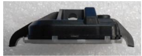
Right side view of Transmitter