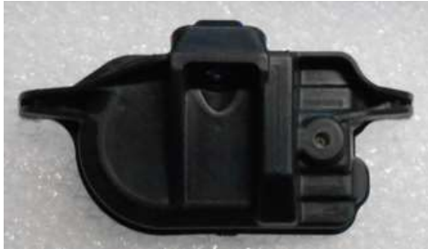
Top view of Transmitter