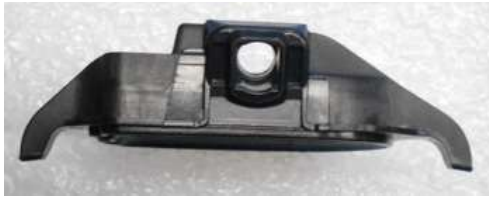
Front view of Transmitter