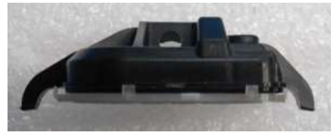
Right side view of Transmitter