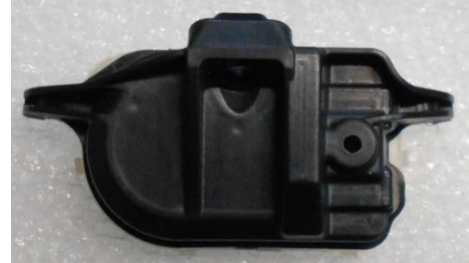
Bottom view of Transmitter