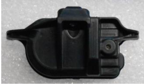
Top view of Transmitter