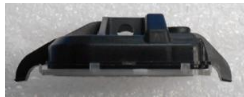
Right side view of Transmitter