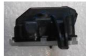
Left side view of Transmitter