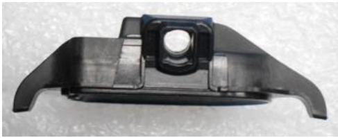
Front view of Transmitter