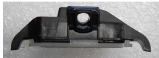
Rear view of Transmitter