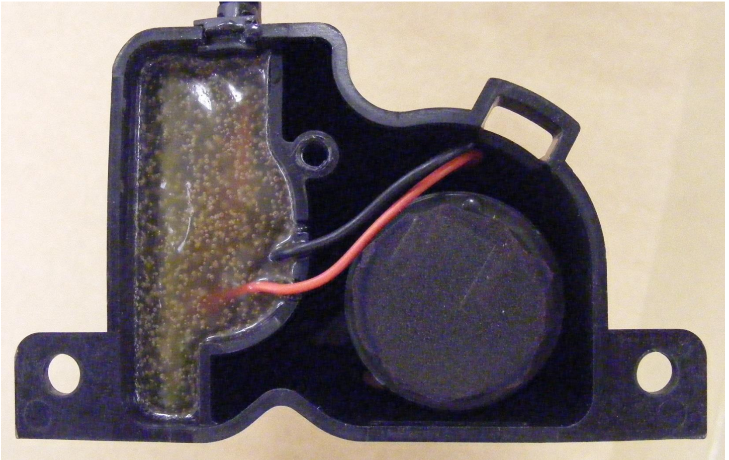
Figure 1: RFW-201 Internal View. Potted