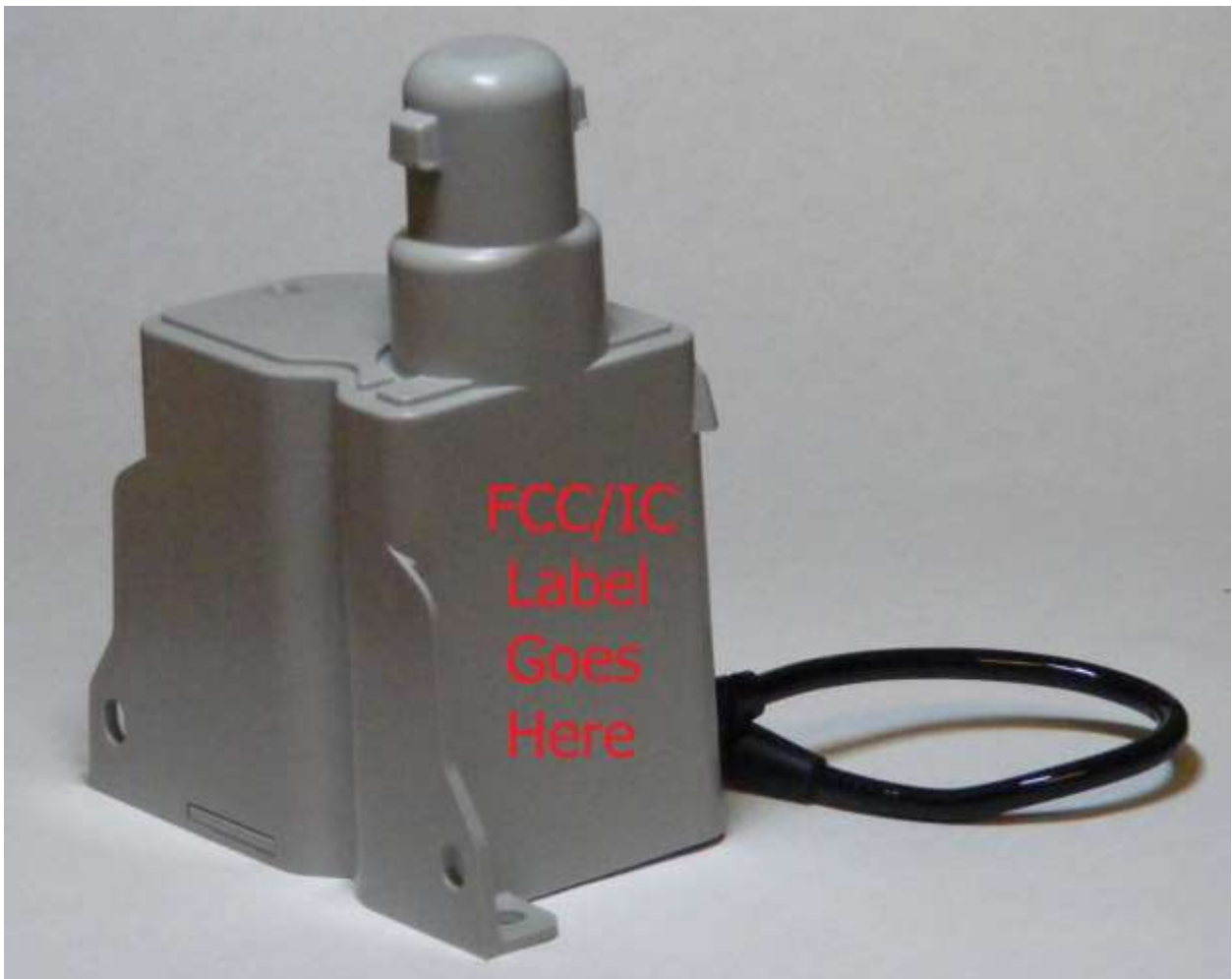
Figure 2: External Label Location