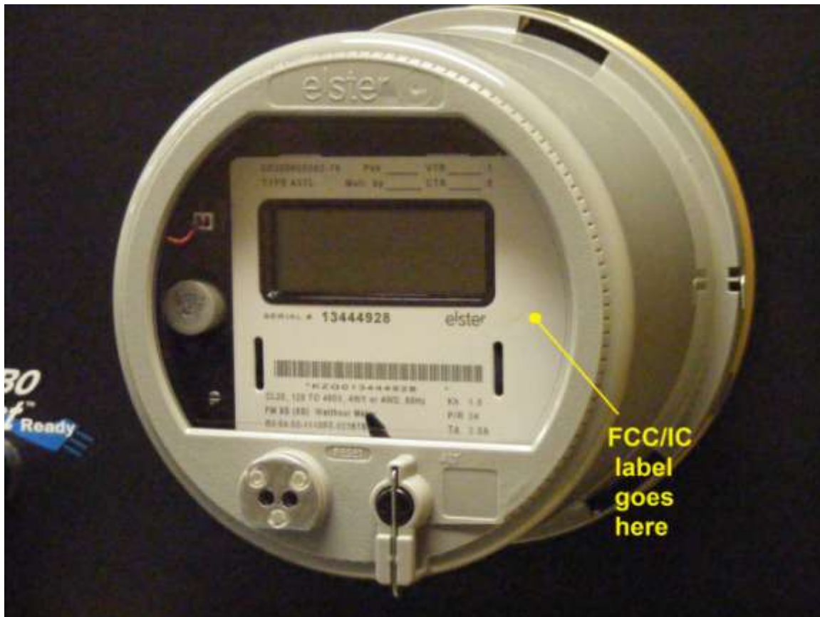
Figure 2: External Label Location