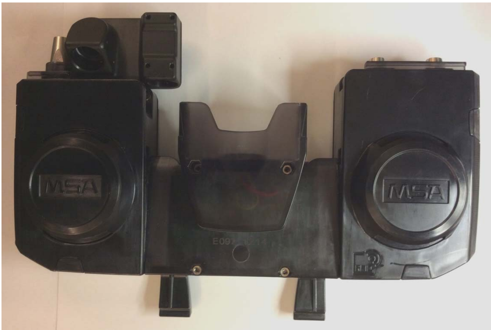
Figure 3 - Power Module Housing (Front)

MSA Corporate Center 1000 Cranberry Woods Drive Cranberry Township, PA 16066 800.MSA.2222 www.MSAnet.com