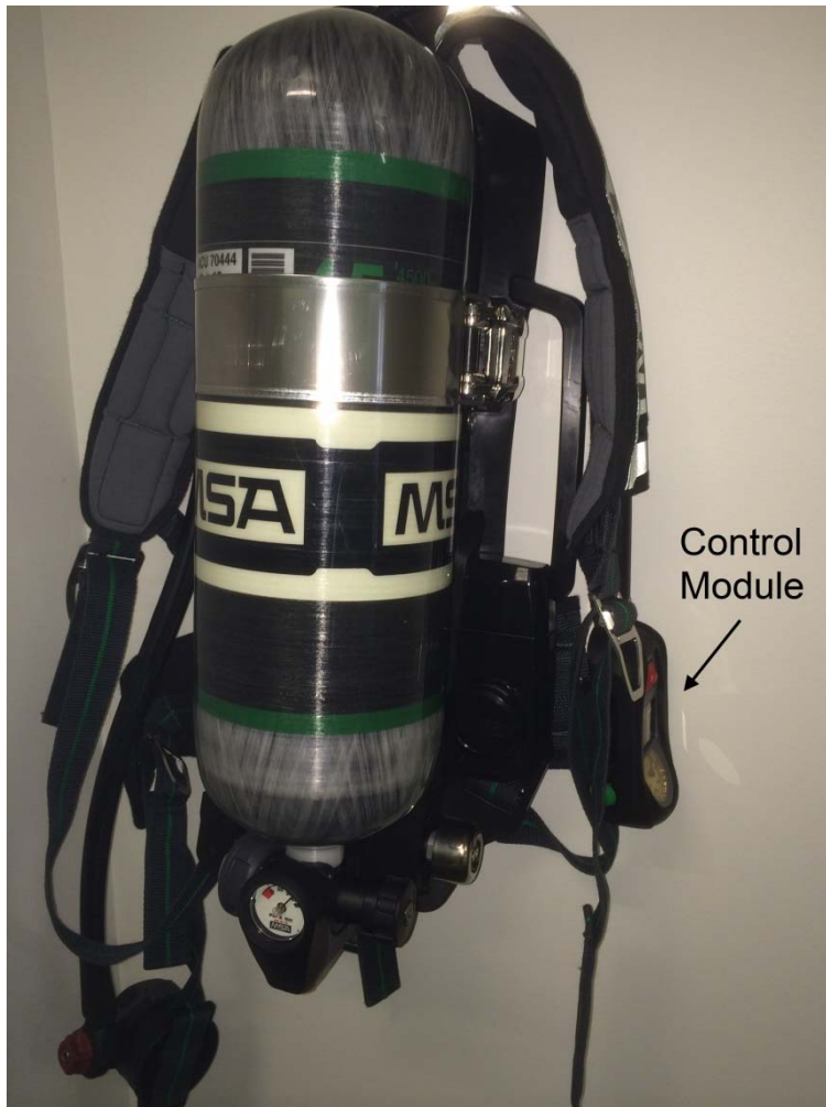
Figure 4 - Complete SCBA Assembly with Control Module

MSA Corporate Center 1000 Cranberry Woods Drive Cranberry Township, PA 16066 800.MSA.2222 www.MSAnet.com