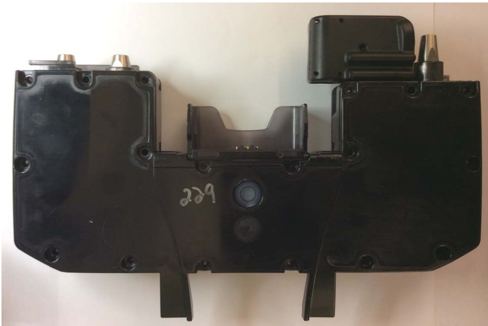
Figure 2 - Power Module Housing (Back)

MSA Corporate Center 1000 Cranberry Woods Drive Cranberry Township, PA 16066 800.MSA.2222 www.MSAnet.com