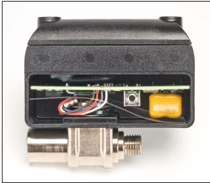
Switch cover removed