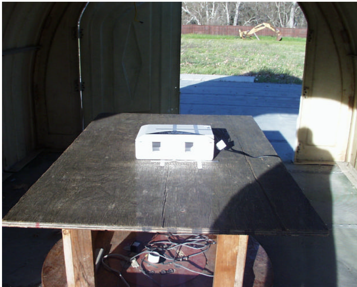
Y Axis Orientation