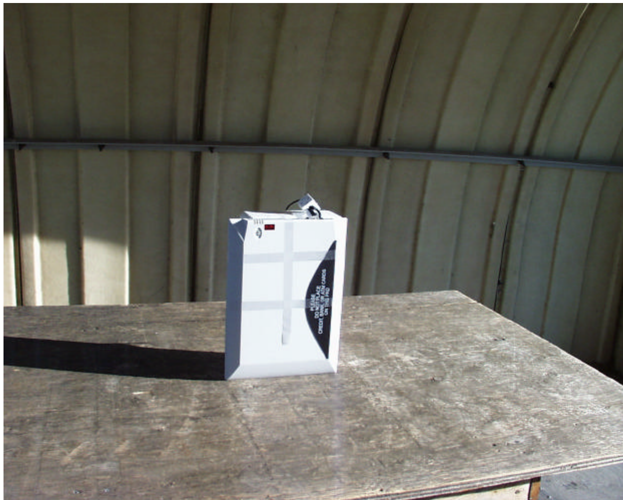
Z Axis Orientation