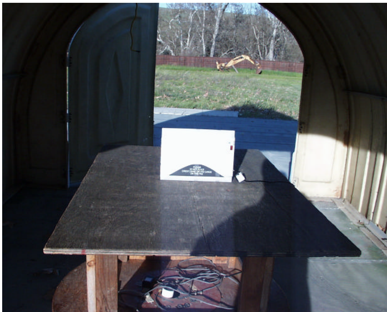
X Axis Orientation (Worst Position)