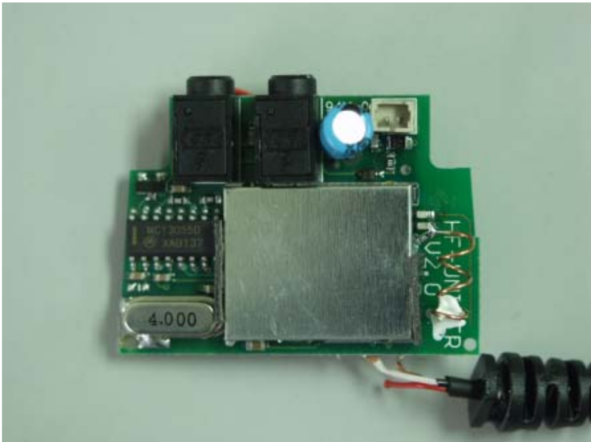
PCB FRONT VIEW