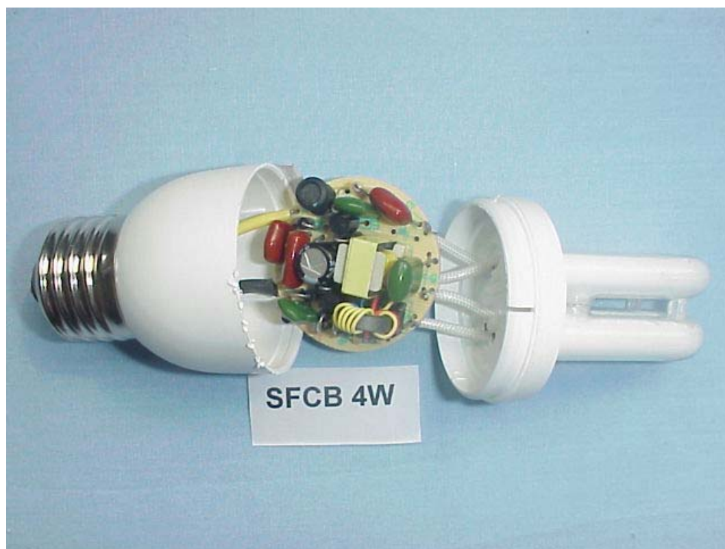
FIGURE 1 ENERGY SAVING LAMP (M/N: SFCB-4W) COVER REMOVED