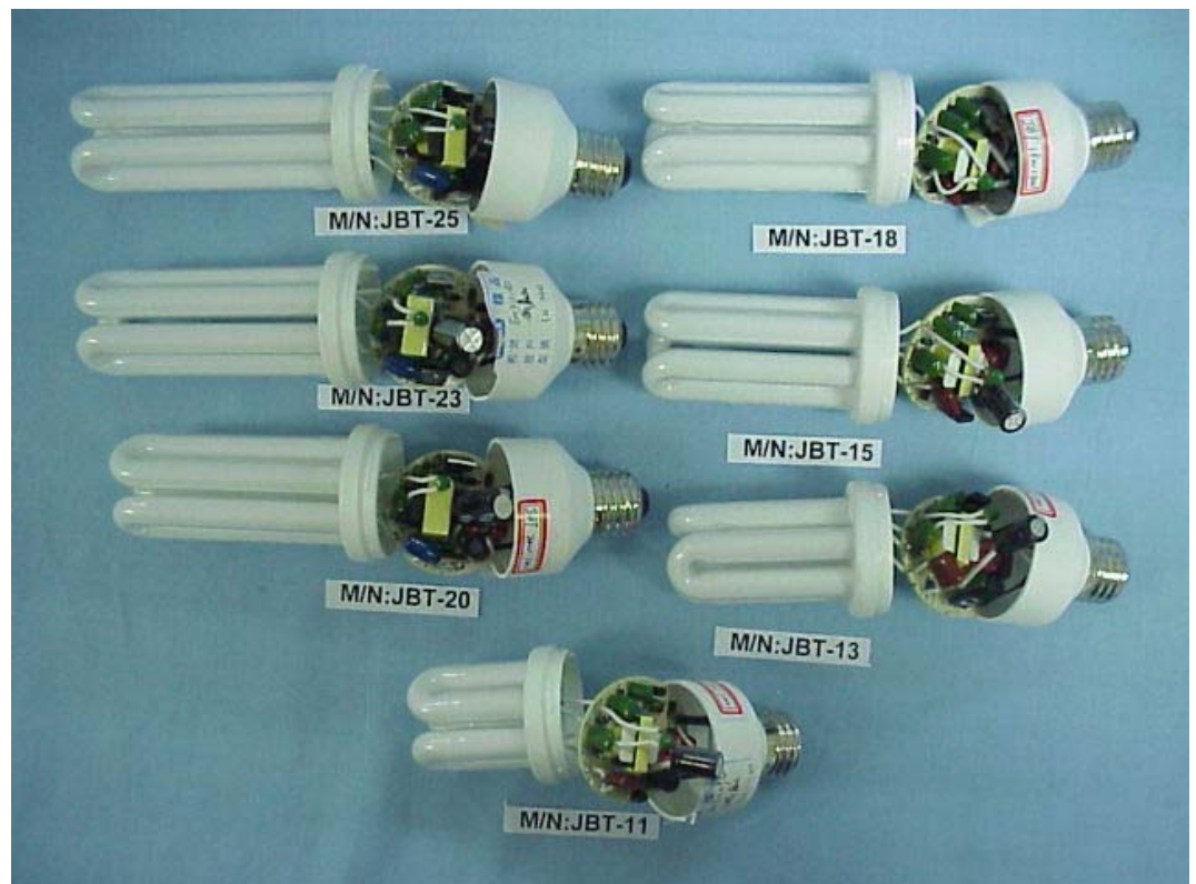
FIGURE 8 ELECTRONIC ENERGY SAVING LAMP (M/N: JBT SERIES) MAIN BOARD (COMPONENT SIDE)