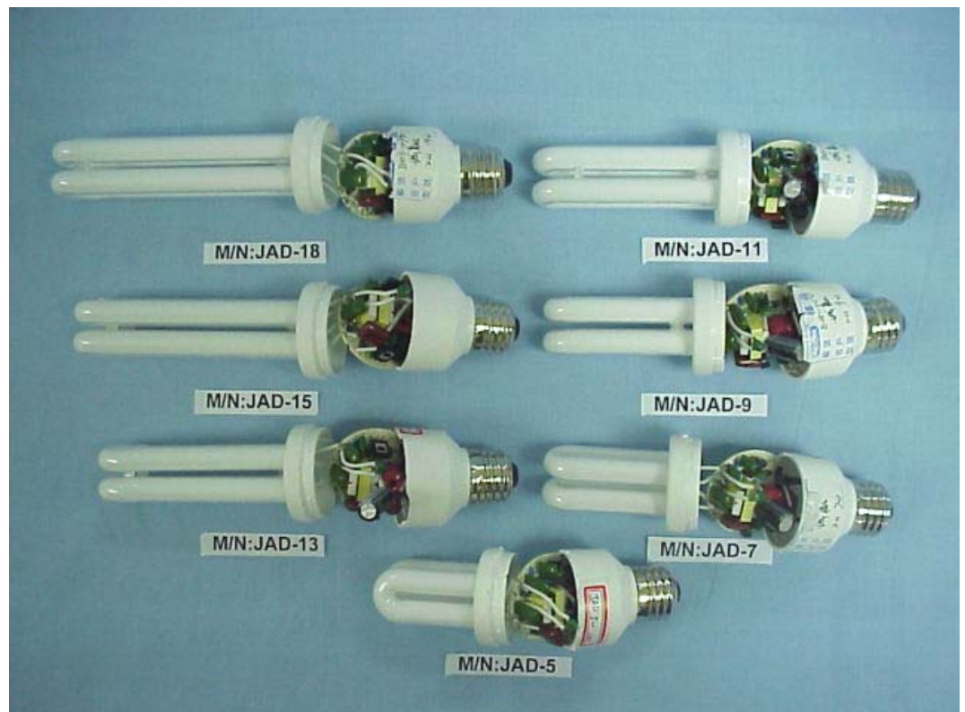
FIGURE 2 ELECTRONIC ENERGY SAVING LAMP (M/N: JAD SERIES) MAIN BOARD (COMPONENT SIDE)