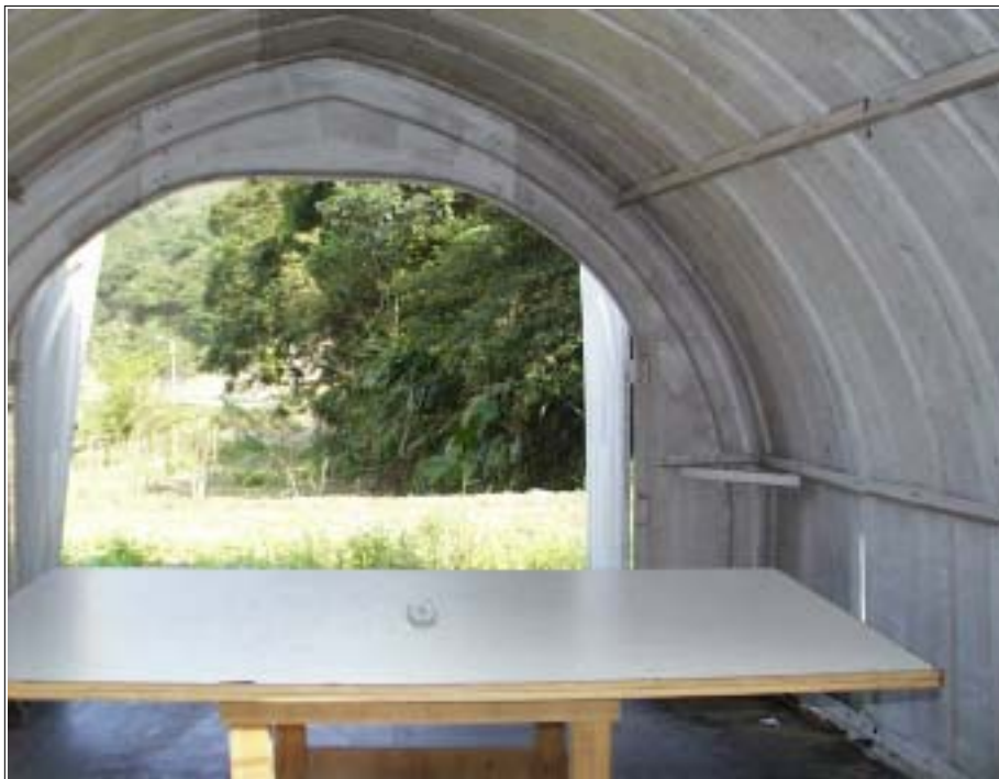
Radiated Open Site Test Set-up