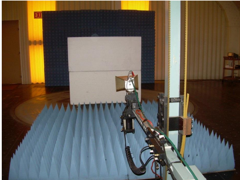
Photograph 6: Reference Photo of Test Setup for Emissions Above 1000 MHz