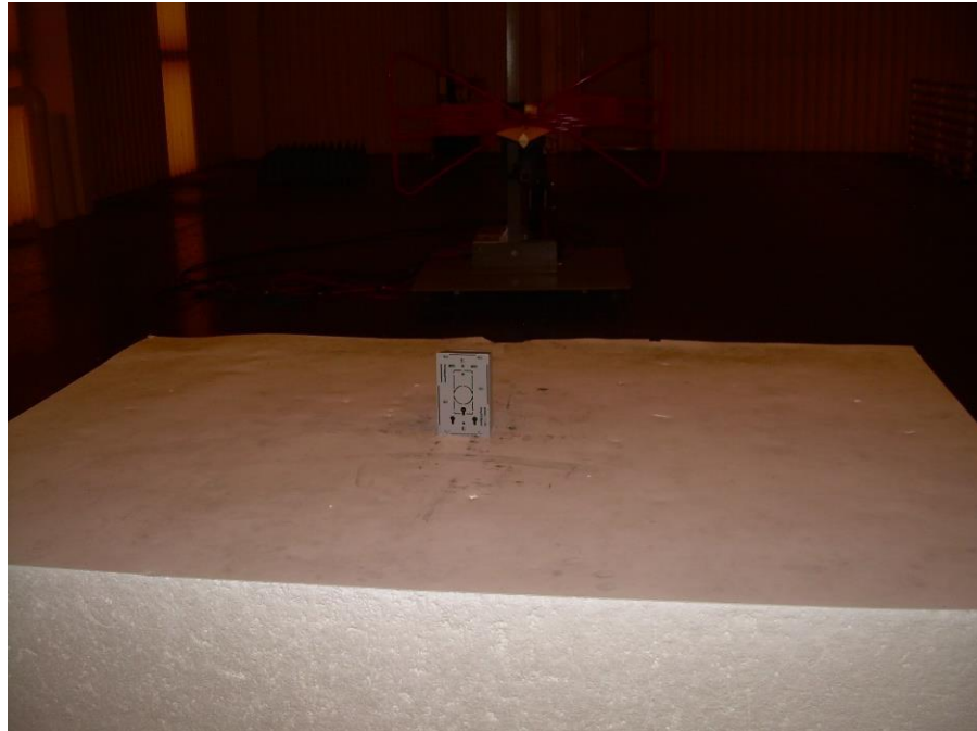
Photograph 2: Back View Radiated Emissions, Below 1000 MHz Worst Case Configuration