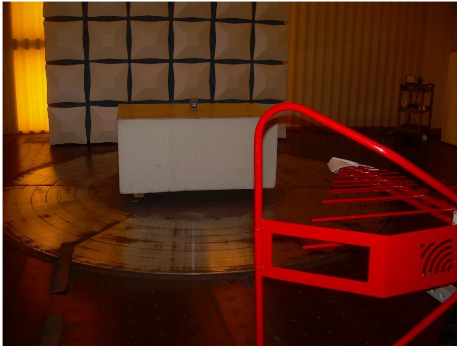
Photograph 1: Front View Radiated Emissions, Below 1000 MHz Worst Case Configuration