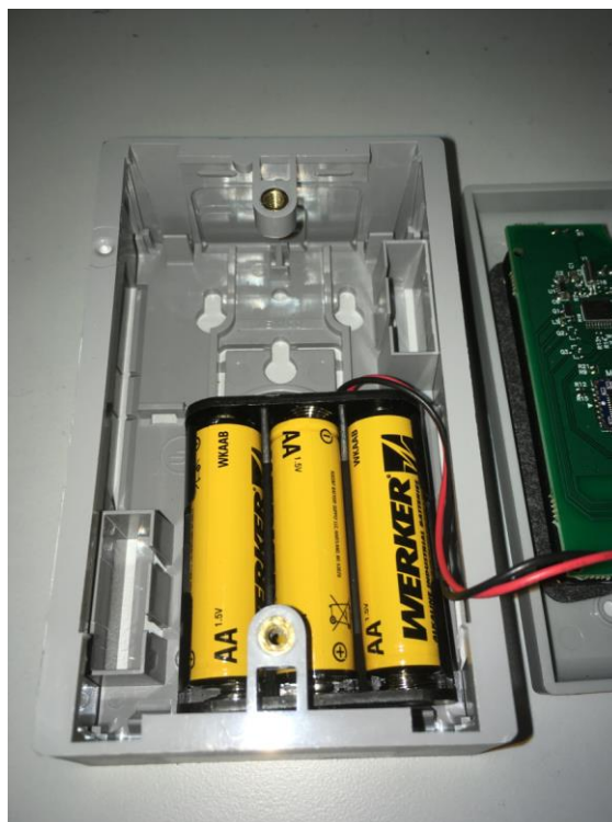
Photograph 6 – View of Back Housing with Battery Placement