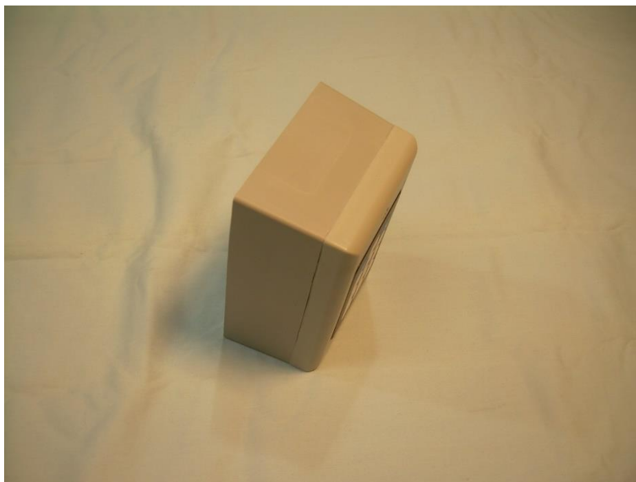
Photograph 4 – Bottom/Side 2 View of the EUT