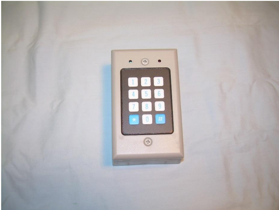
Photograph 1 – Front View of the EUT