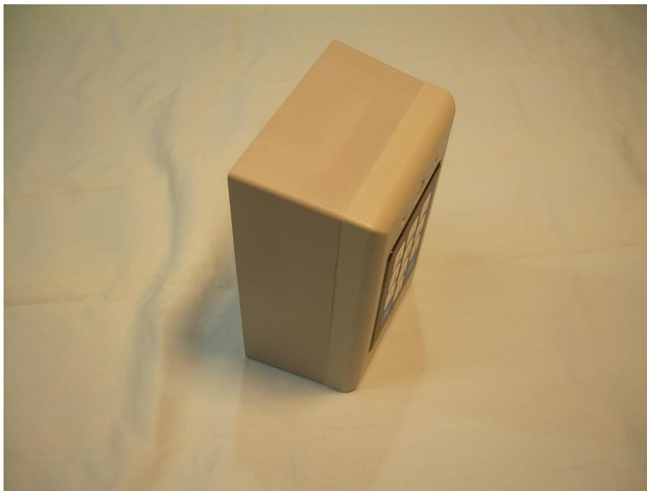
Photograph 3 – Top/Side 1 View of the EUT