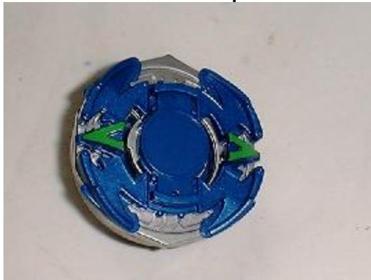
Front View of the product