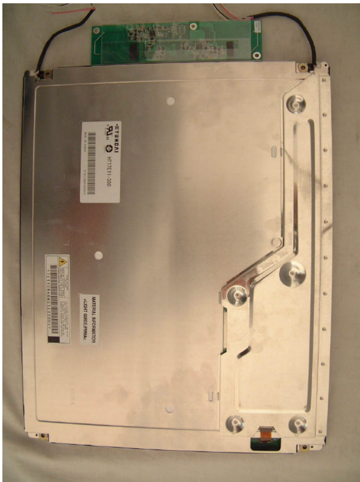
<REAR VIEW OF LCD>