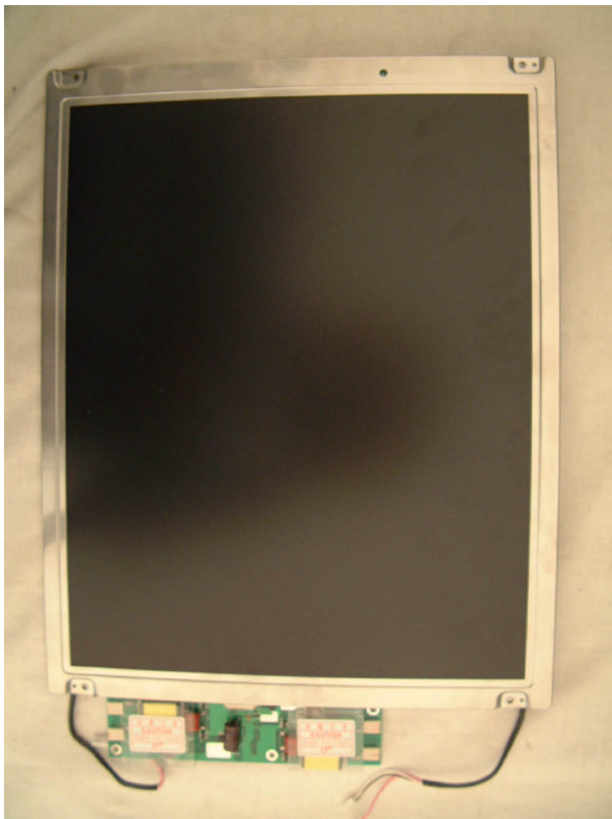
<FRONT VIEW OF LCD>