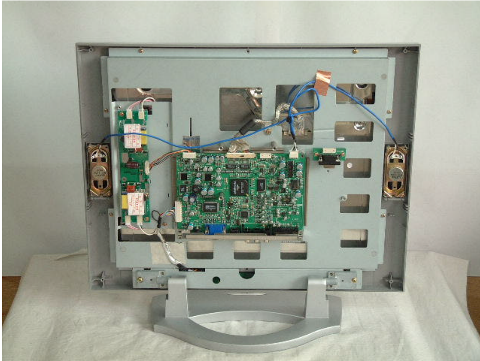
<INTERNAL VIEW OF E.U.T>