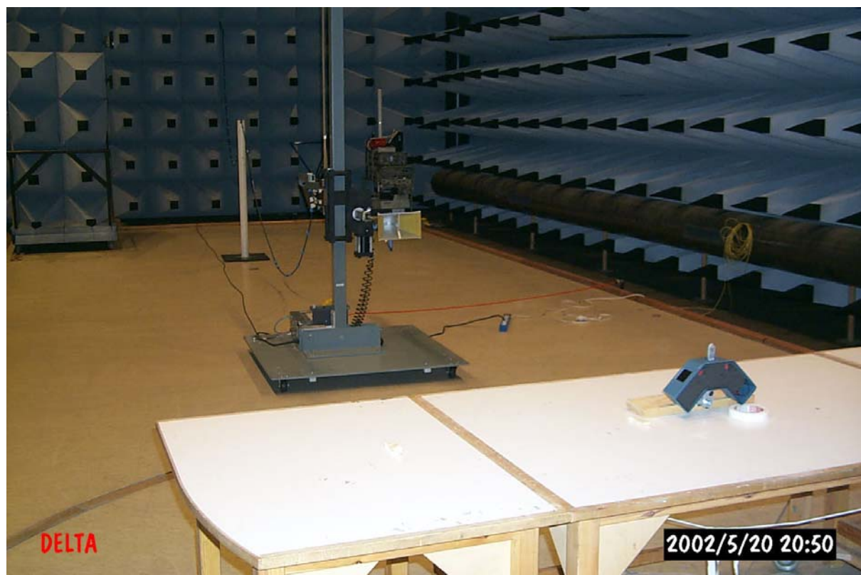
Photo 2 Set-up for measurements 1 GHz to 10 GHz.