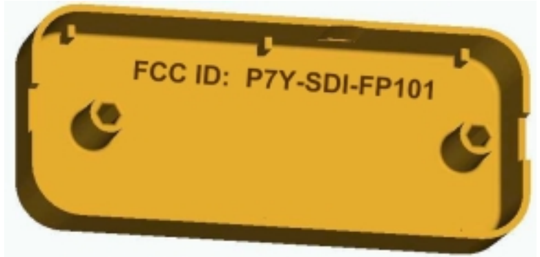
Flat Package – Text is 8 Point, engraved inside lid