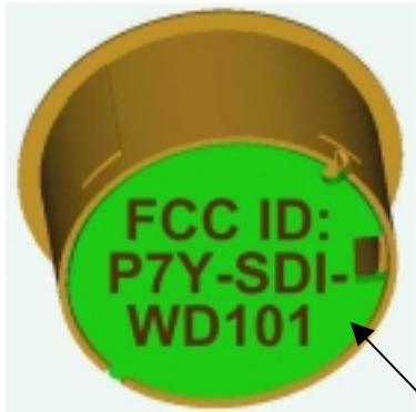
Window Dowel - Text is 8 point, engraved on cap.

The following FCC identifier drawings are based on drawings rather than completed packages, which are in the process of being molded at this time.