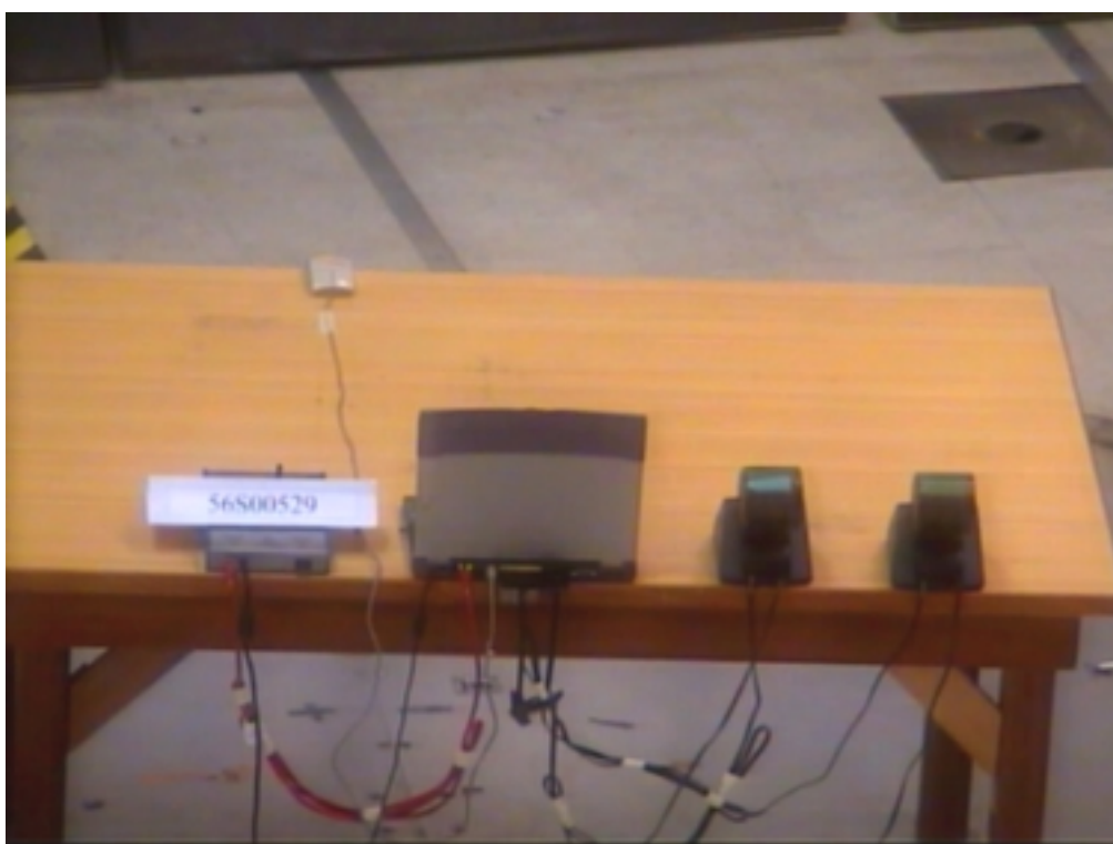
Radiated Emissions – Rear View