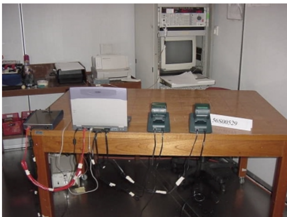
Conducted Emissions – Rear View