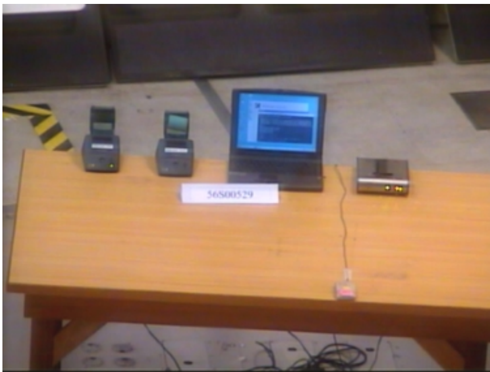
Radiated Emissions - Front View