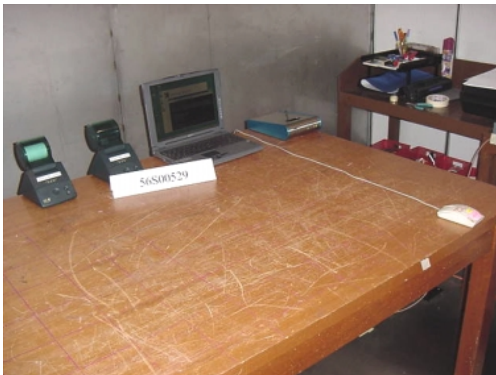
Conducted Emissions – Front View