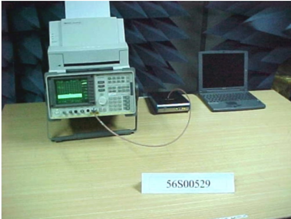
Test Setup of