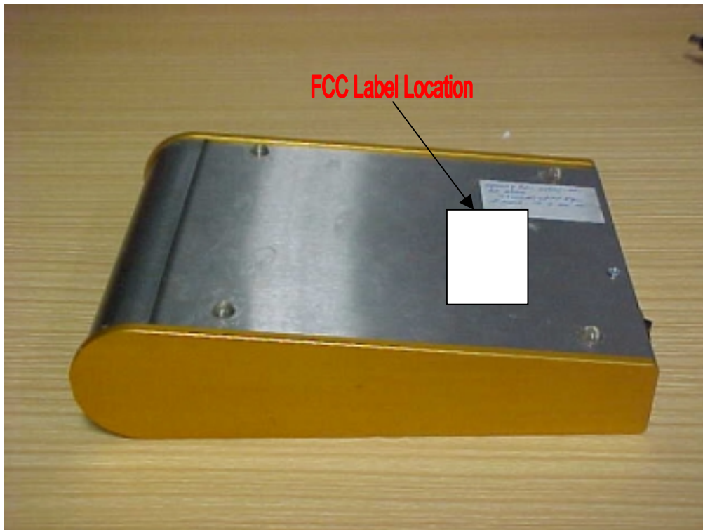
Physical Location Of Label On EUT