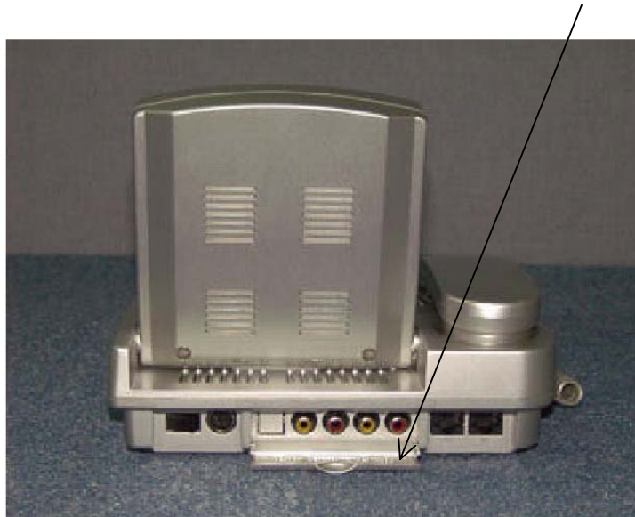
Back Side of EUT / Proposed FCC ID Label Location