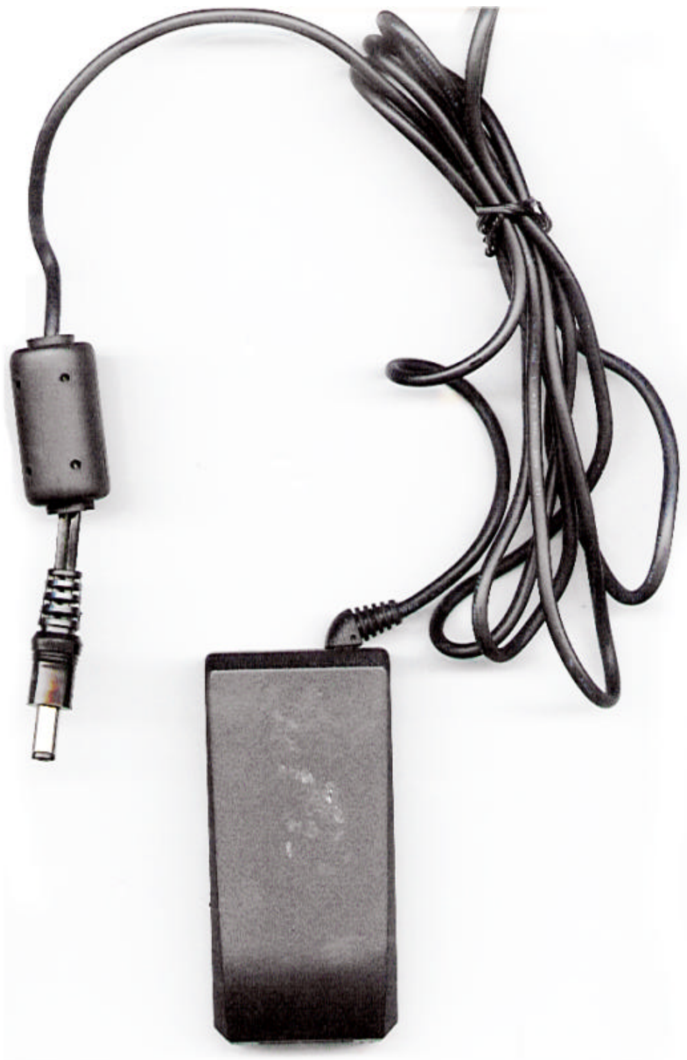
POWER SUPPLY UPPER VIEW