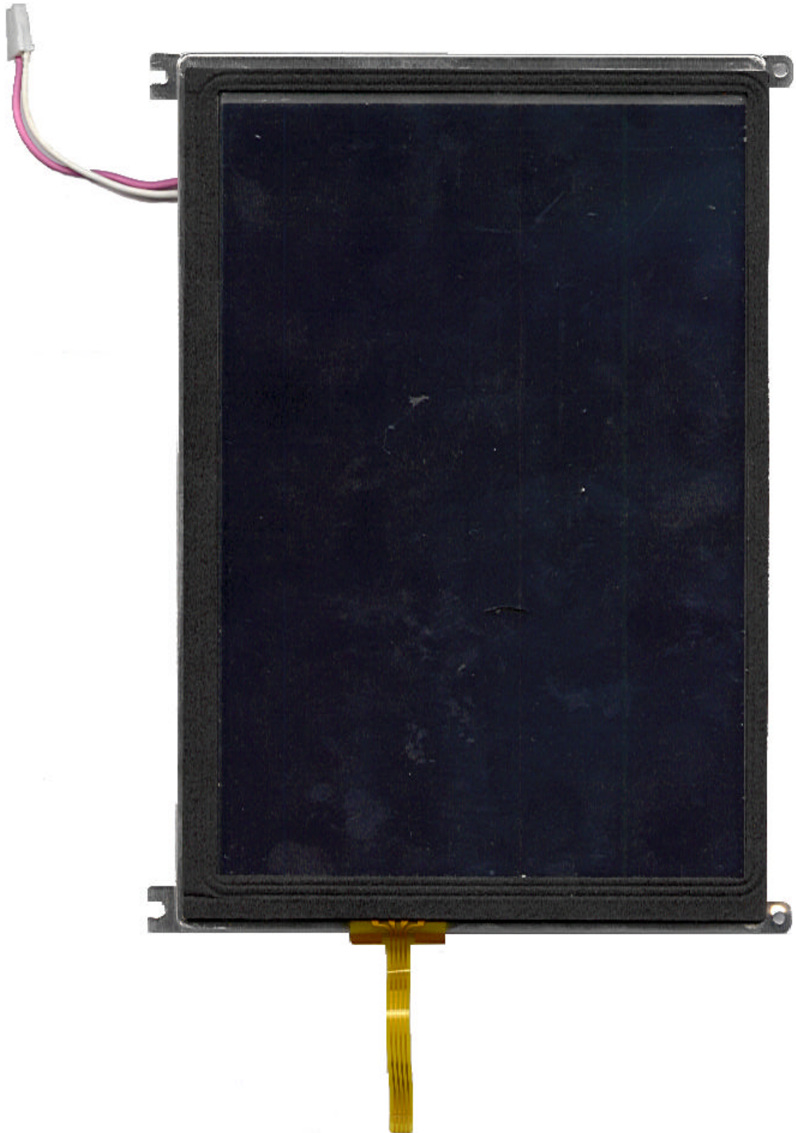
DISPLAY MODULE FRONT VIEW