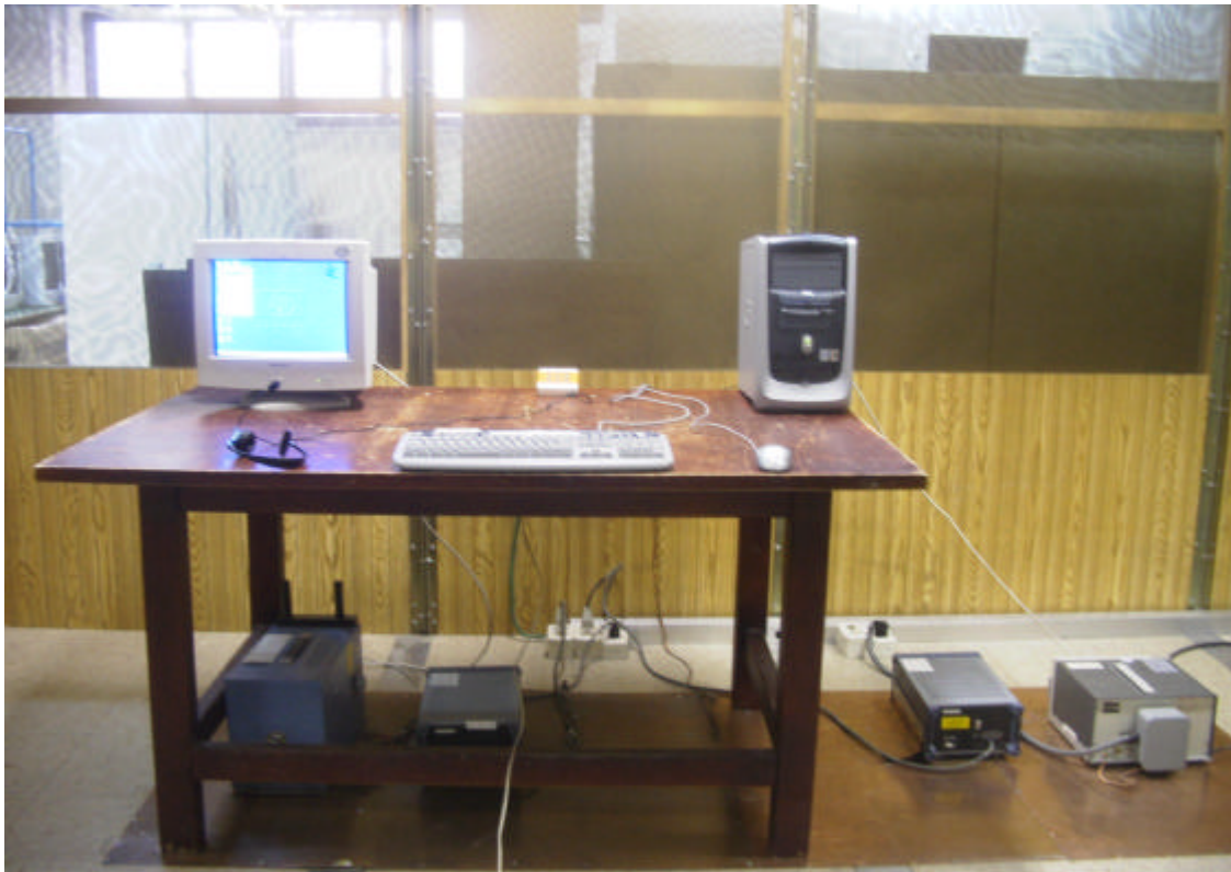
Conducted Emission 450kHz ~ 30MHz