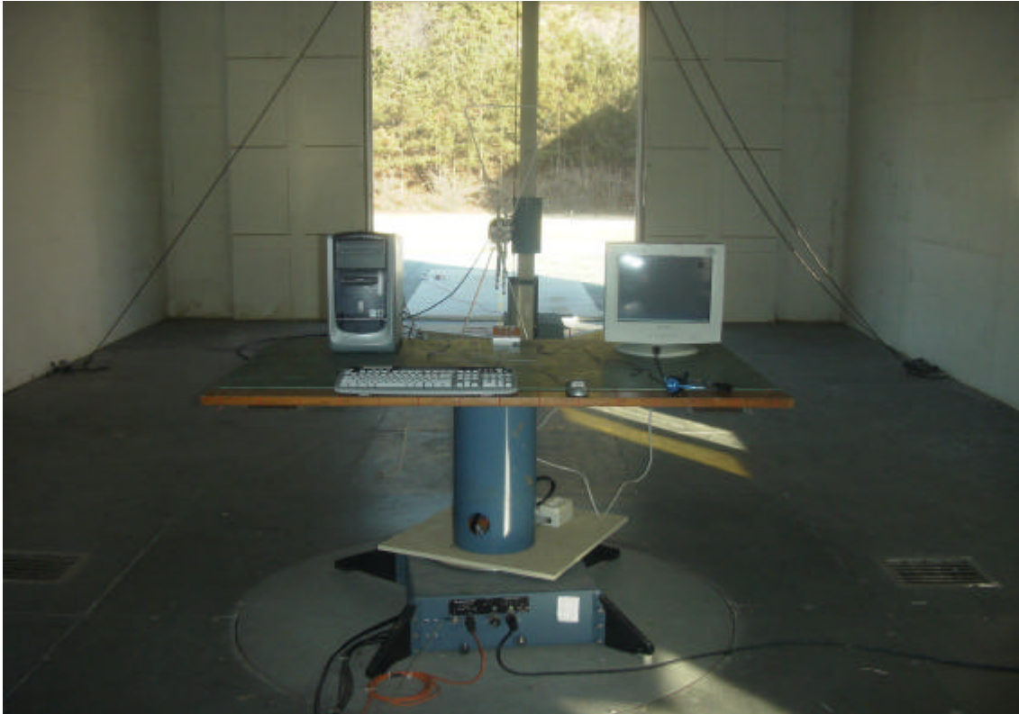
Radiated Emission 30MHz ~ 1000MHz