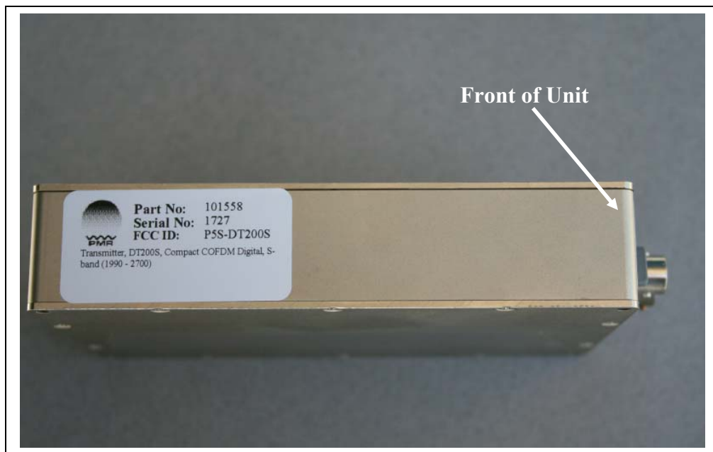
Fig 6. DT-200S with FCC ID Label