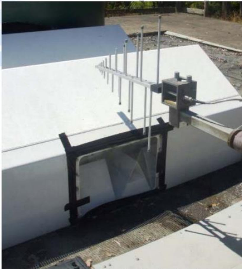
Test Antennas Used – Horn Antenna