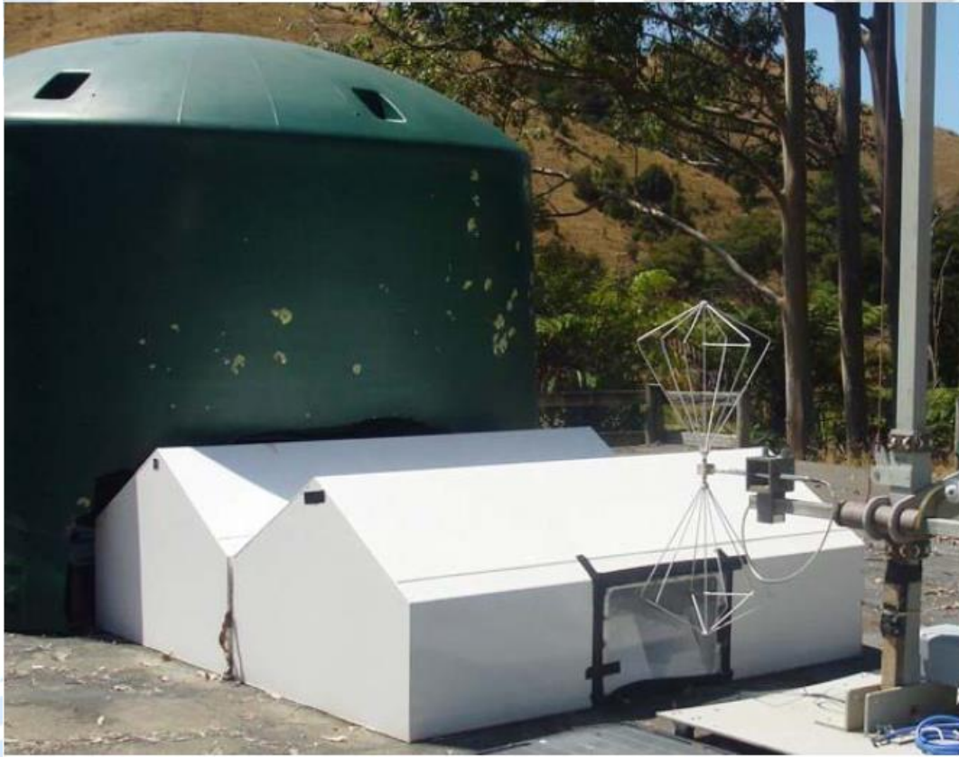
Test Shed showing the use of a Log periodic Antenna