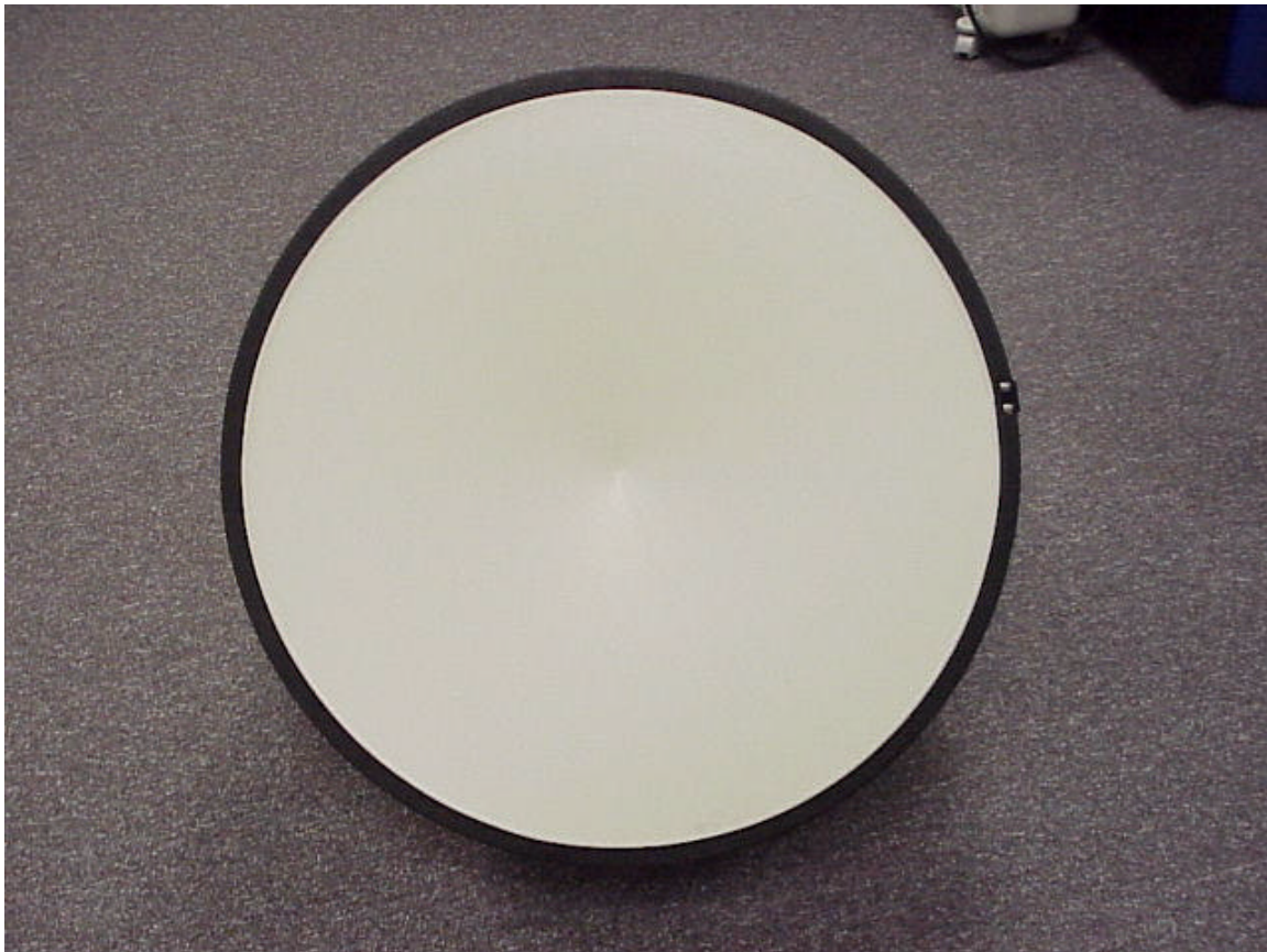
Photograph of EUT – Front view

Both Access Units (Type A and Type B) are identical in mechanical construction. The following photographs represent both types of Access Unit.