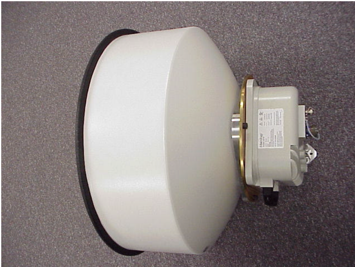
Photograph of EUT – Label side view